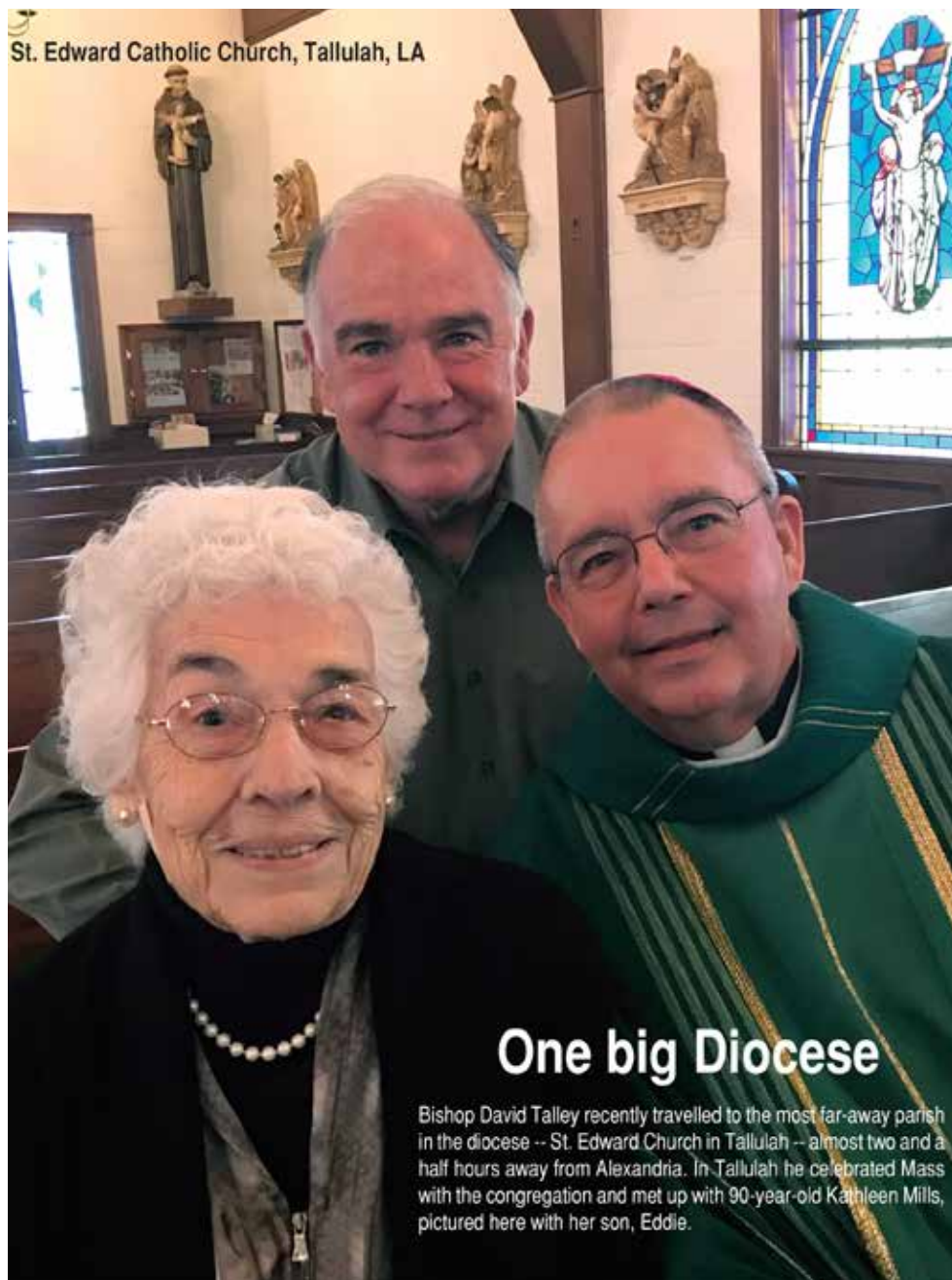
St. Edward Catholic Church, Tallulah, LA