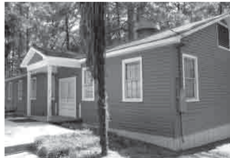
DUCOTE HALL looks fresh and clean now with new aluminum siding. Inside renovations of Ducote Hall are in progress.