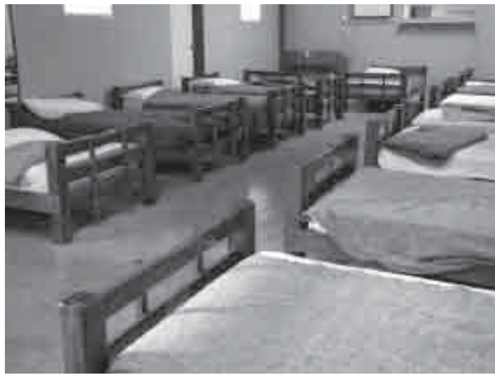
GUEST ACCOMMODATIONS. In one of the buildings currently used by Maryhill guests, 13 people sleep in one room and share this one bathroom.