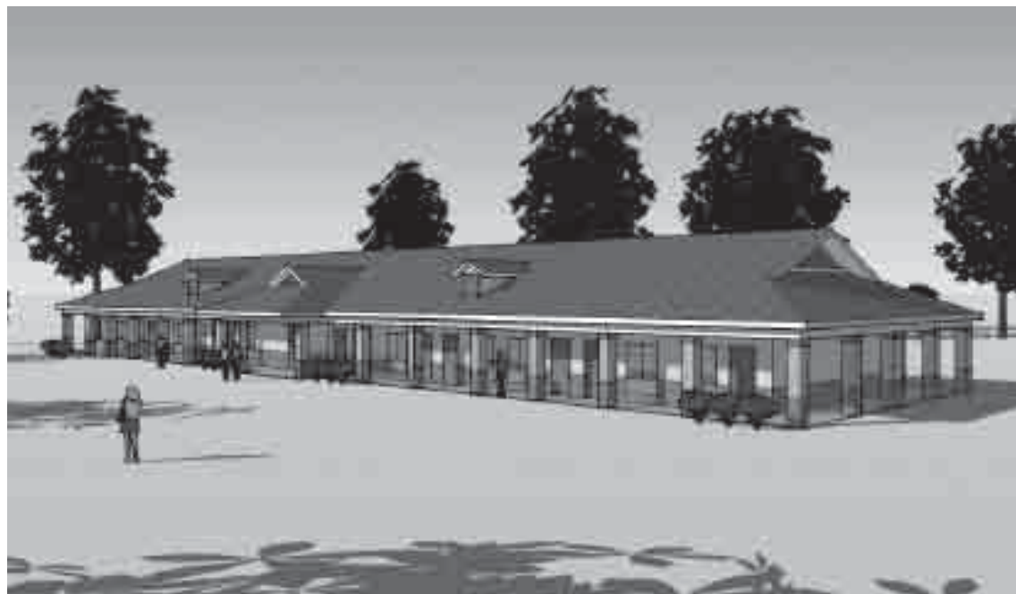
ARCHITECTURAL PLANS FOR NEW HOUSING UNITS. Modern and elegant new housing units, accommodating 46 guests each, will be constructed on both sides of the lake. Plans include construction of three housing units.