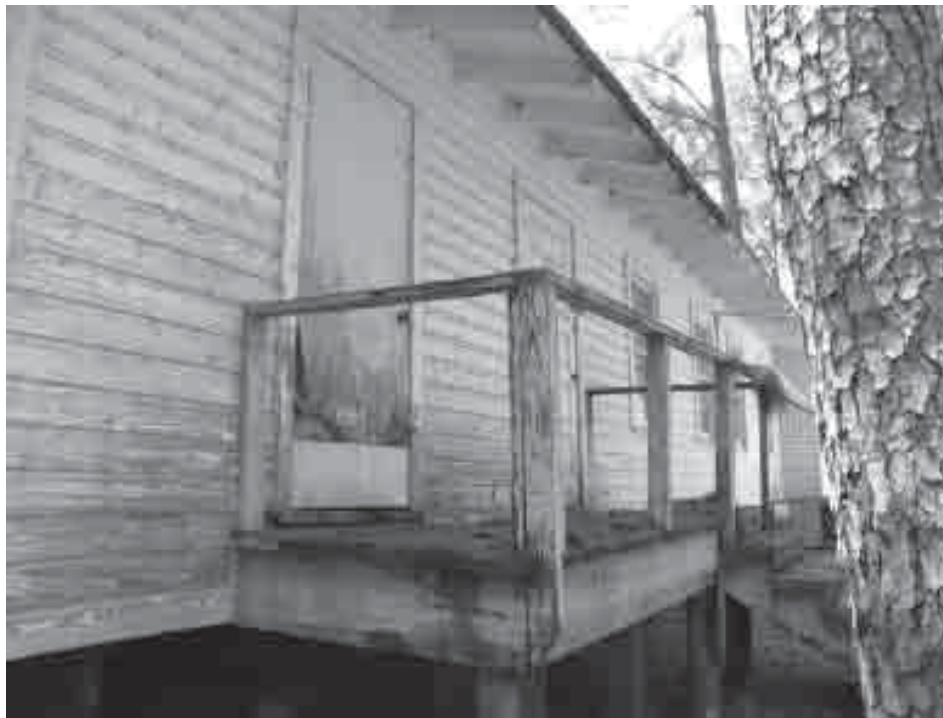
MEETING ROOM TO COME DOWN. Due to the deterioration of this old meeting room, it will be torn down to make room for one of the 46-bed housing units.