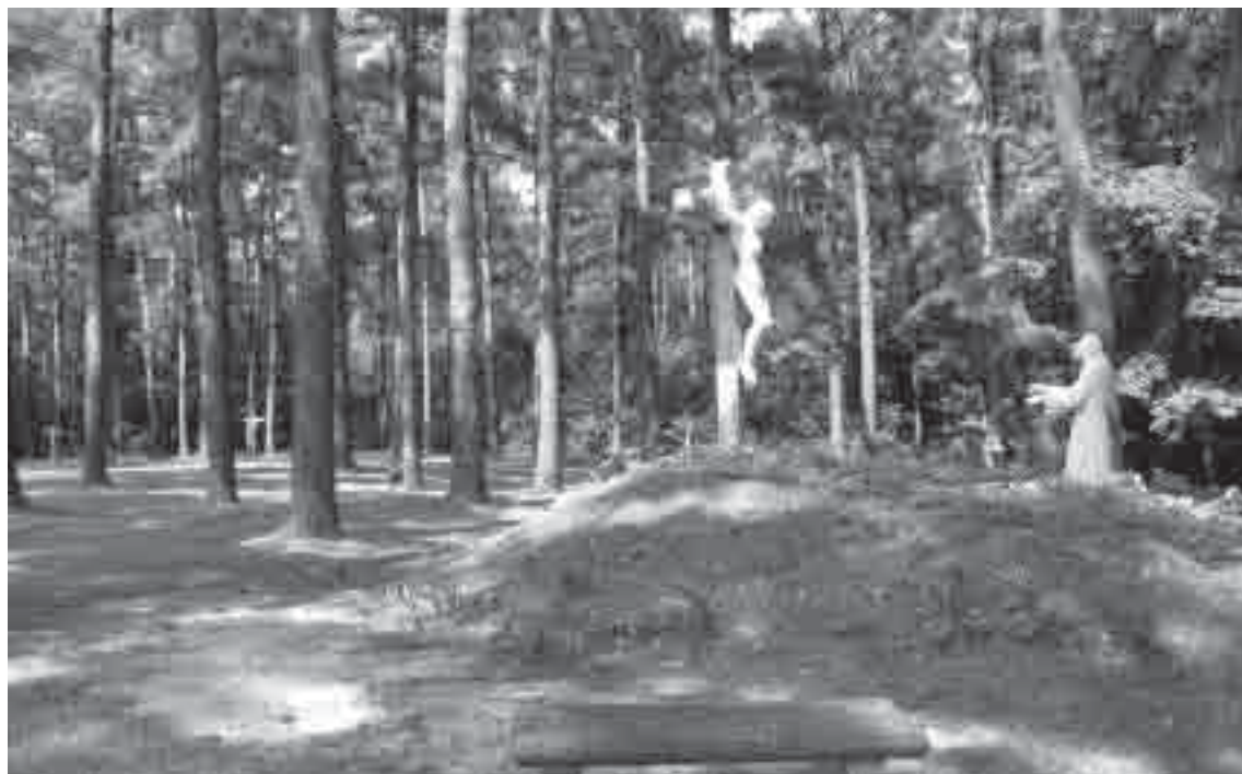
THE STATIONS OF THE CROSS GARDEN was cleared of overgrown trees and shrubs, statues power-washed and cleaned, and the gardens enhanced with flower beds and lights.

• Ducote Hall -- exterior of building replaced with alumi-