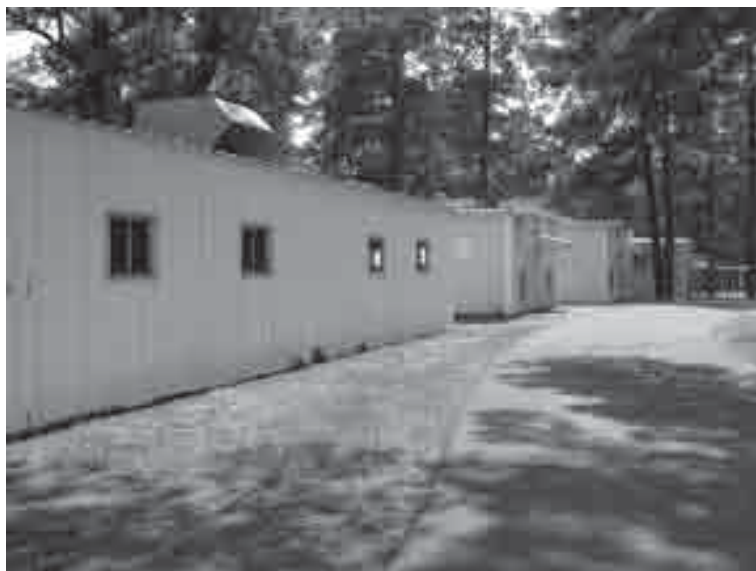
OUT WITH THE OLD; IN WITH THE NEW. The four metal buildings on the youth side of Maryhill will be torn down to make room for one of the new housing units. Accommodating 46 guests, the new housing unit will face the lake.

num siding and aluminum fascia boards, which will dramatically reduce the cost of maintenance in the future. The building is now light gray with white trim. A new roof is in the renovation plans.