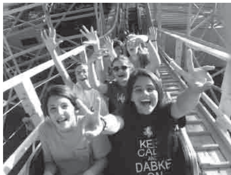
JUNIOR HIGH students visit King Island on the last day of their trip.

JUNIOR HIGH GROUP. 29 junior high students and 6 chaperones participated in Catholic Heart Workcamp in Cincinnati, Ohio.