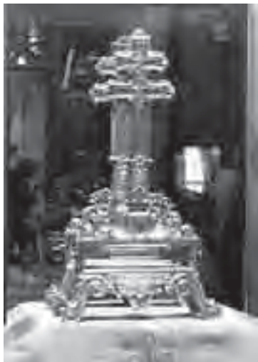
Reliquary of the True Cross in Jerusalem

A Jew by the name of Judas, aware of the tradition concerning the hiding of the Cross, led those excavating the Holy Sepulchre to the spot