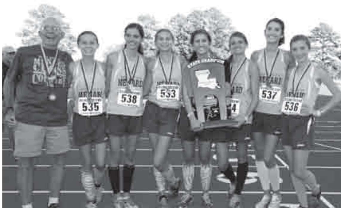
2013 GIRLS STATE CHAMPIONS. The Menard girls clinched the 8th state championship title last November at Northwestern State University. Pictured are and