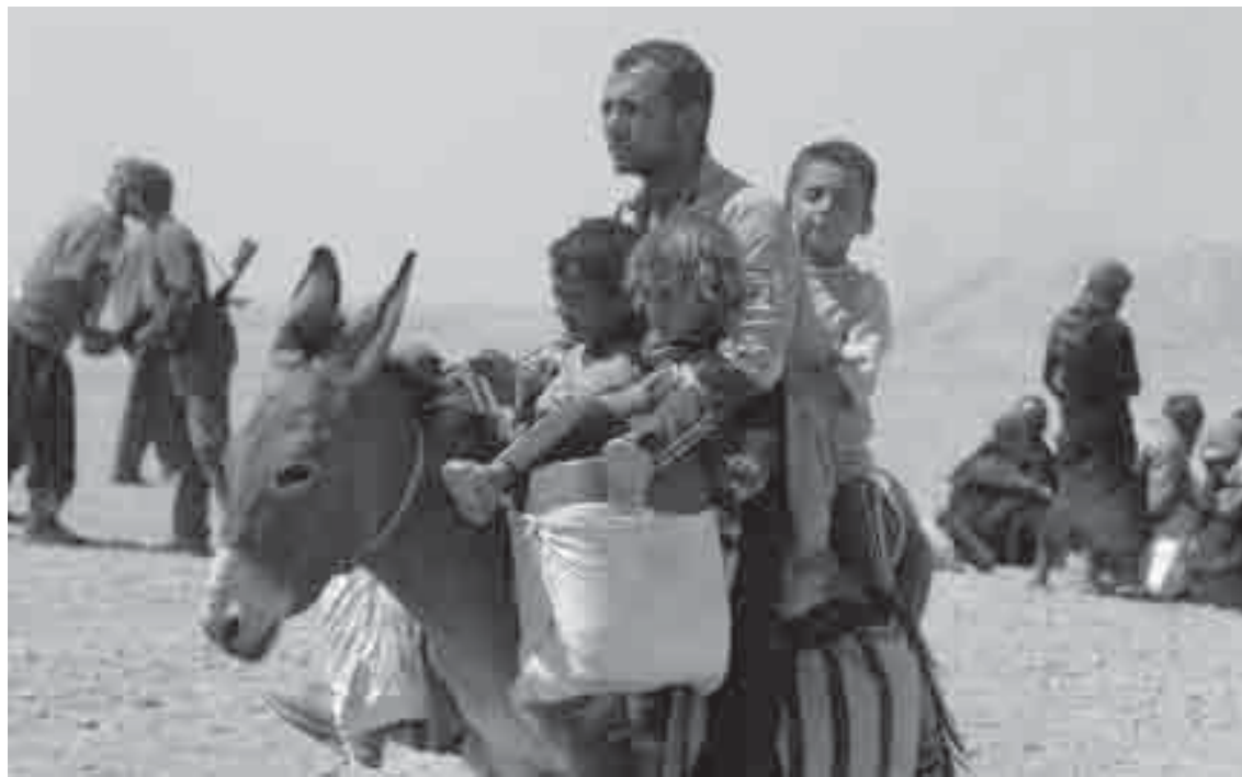
A MAN AND THREE CHILDREN FLEE VIOLENCE from forces loyal to the Islamic State in Sinjar, Iraq, Aug. 10. Islamic State militants have killed at least 500 Yazidi ethnic minorities, an Iraqi human rights minister said.

The document noted that the "majority of Muslim religious and political institutions" have opposed the Islamic State's