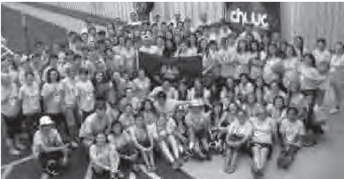
JR. HIGH student