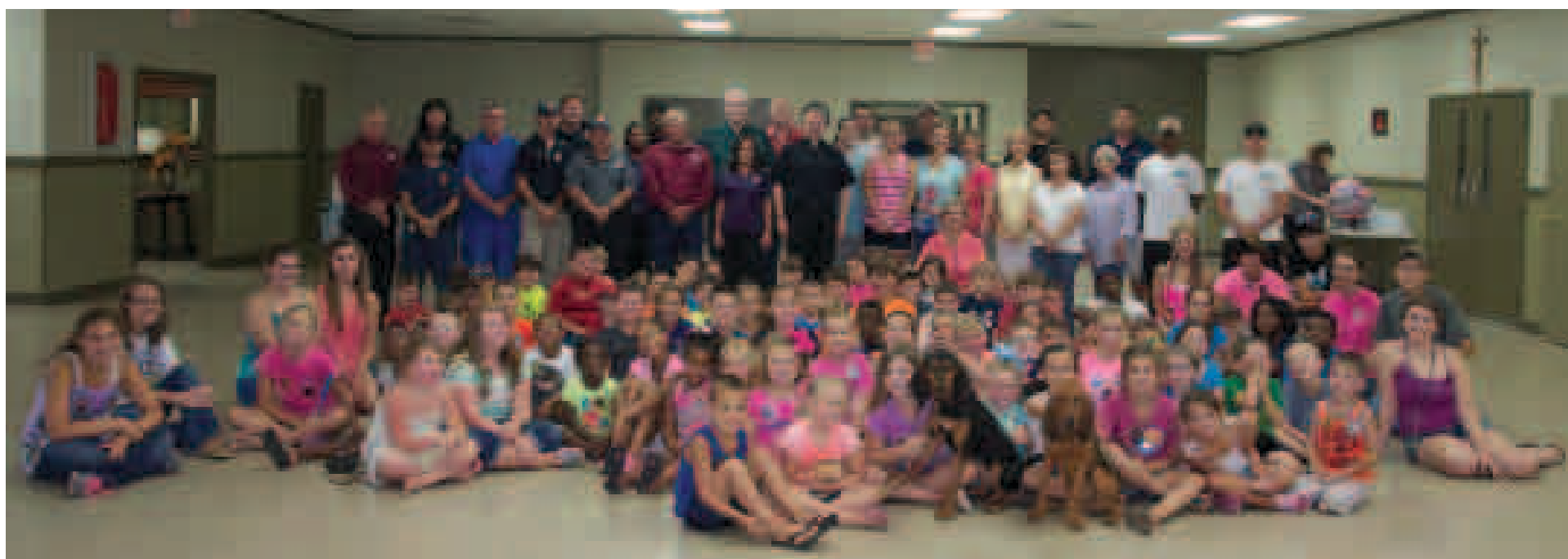
BELOW: VBS at St. Joseph, Marksville