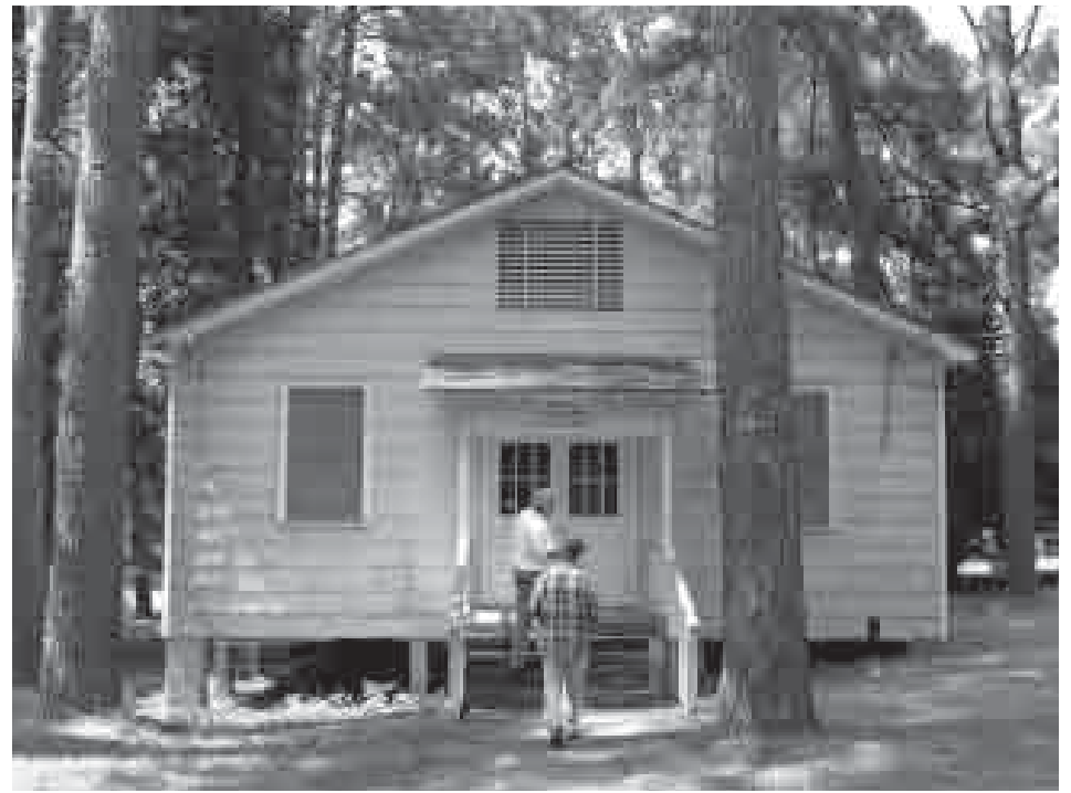
OLD BOOKSTORE. The old bookstore will be renovated into a meeting room to accommodate 100 people.