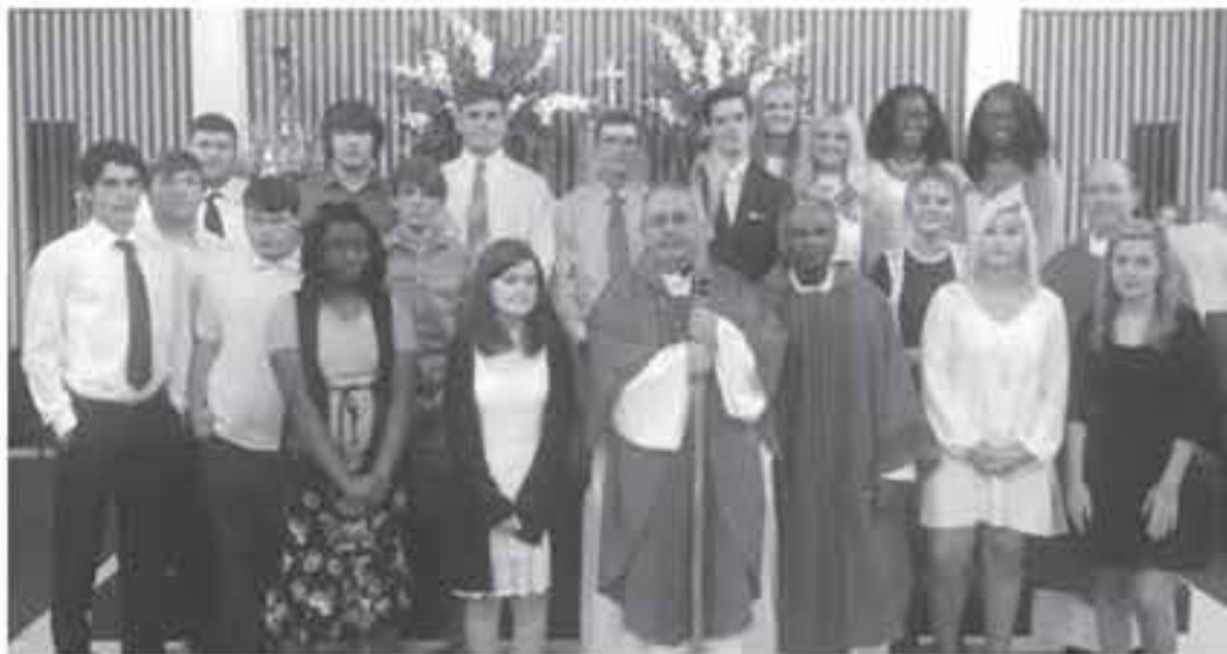
CONFIRMATION, CHRIST THE KING CHURCH (Simmesport), May 30, 2018.