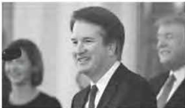
PRESIDENT TRUMP NAMES NOMINEE FOR SCOTUS. On July 9 at the White House, President Donald Trump named Brett Kavanaugh, a Catholic, who is a judge on the U.S. Court of Appeals for the District of Columbia Circuit, as his Supreme Court nominee.