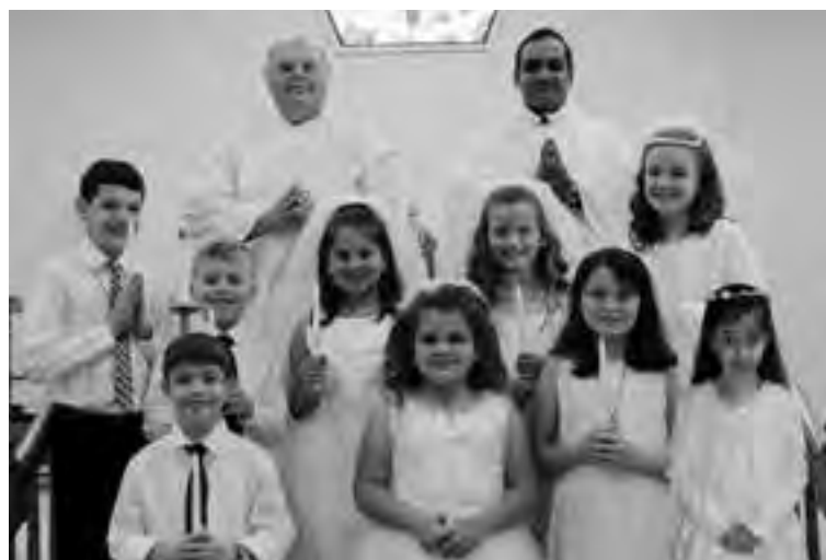
FIRST COMMUNION, STS. FRANCIS AND ANNE CHURCH (Kolin). Nine students made their First Holy Communion: