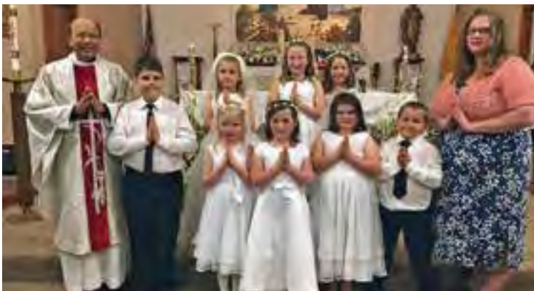
IMMACULATE CONCEPTION (Dupont) CELEBRATED FIRST COMMUNION on Mother's Day, May 13.