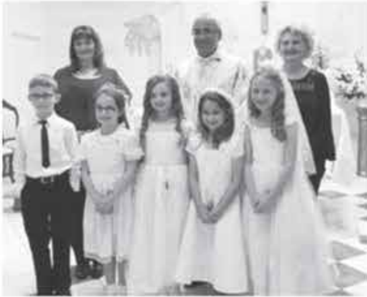
FIRST COMMUNION, ST. GENEVIEVE (Brouillette), April 8, 2018.