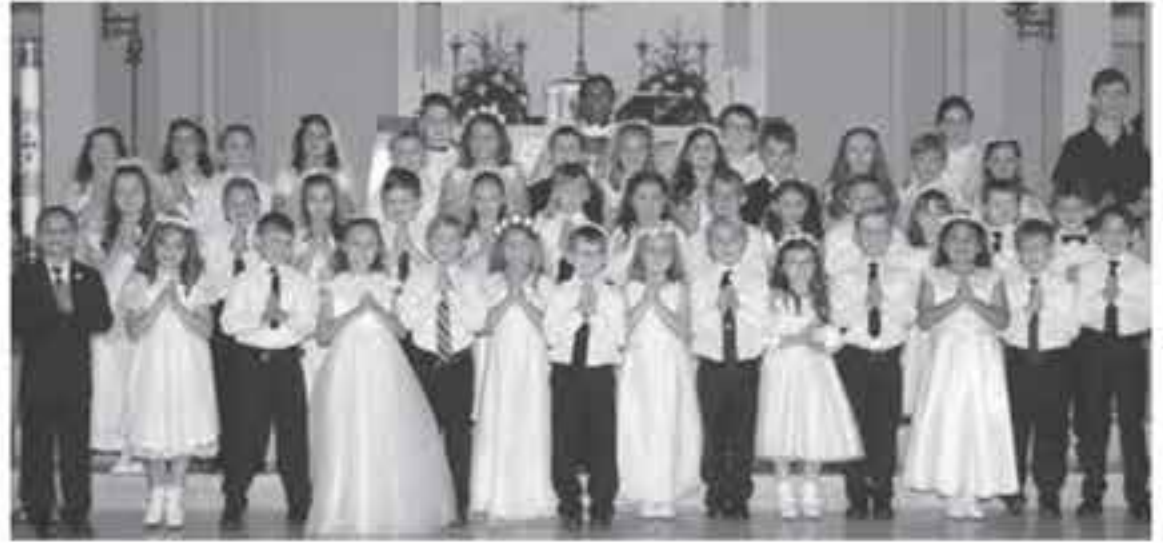
FIRST COMMUNION, SACRED HEART CHURCH (Moreauville), held on Saturday, May 5.