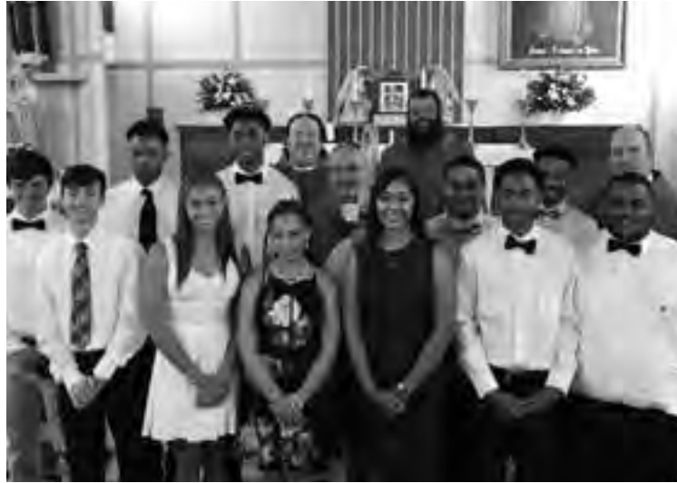
ST. ANTHONY OF PADUA CHURCH (Natchitoches), Wednesday, June 20.