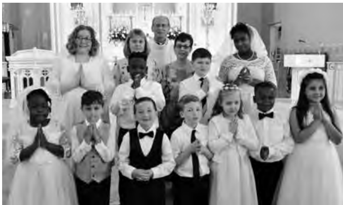
ABOVE: FIRST COMMUNION, ST. PAUL THE APOSTLE AND OUR LADY OF PROMPT SUCCOR (Mansura), held May 6 at St. Paul's. Eleven students pictured