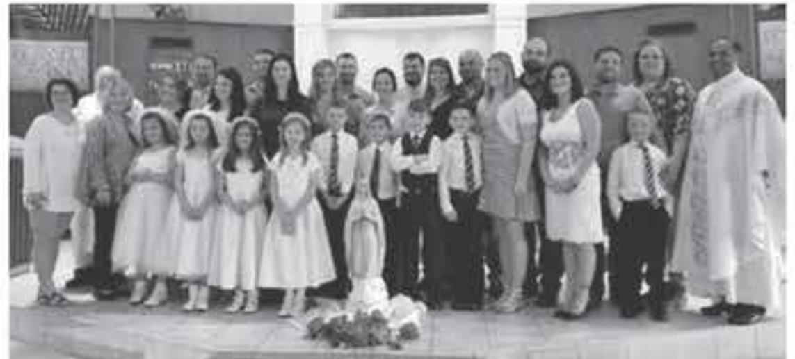
FIRST COMMUNION, OUR LADY OF LOURDES (Fifth Ward). Nine students from Our Lady of Lourdes in Fifth Ward received First Communion on March 18.