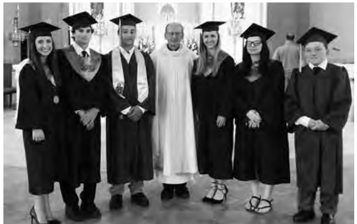
ST. PAUL THE APOSTLE (Mansura) GRADUATION MASS. The 2018 high school graduation Mass was held at St. Paul's in Mansura, Saturday, May 12.