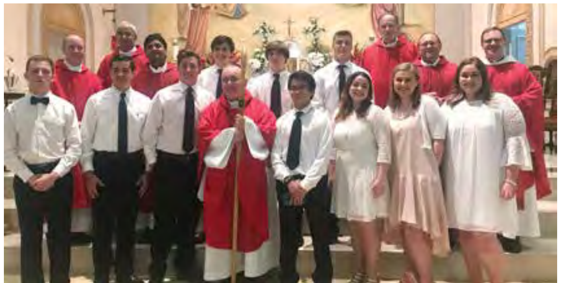
CONFIRMATION, ST. JOSEPH CHURCH (Marksville), on April 25, 2018.