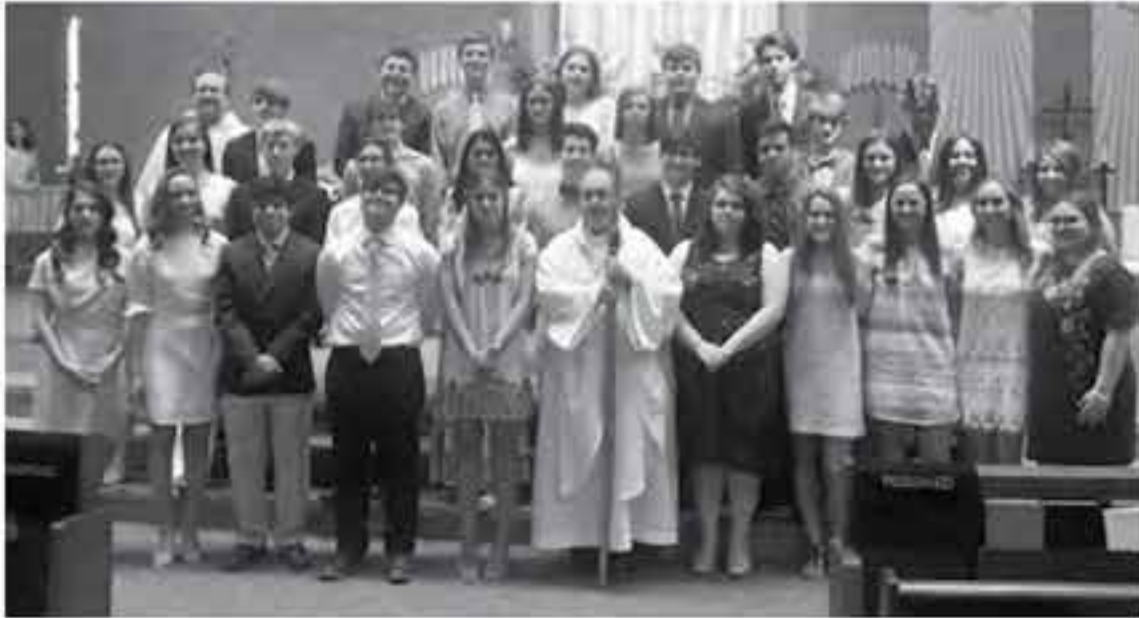
CONFIRMATION, OUR LADY OF PROMPT SUCCOR CHURCH (Alexandria), on April 2.