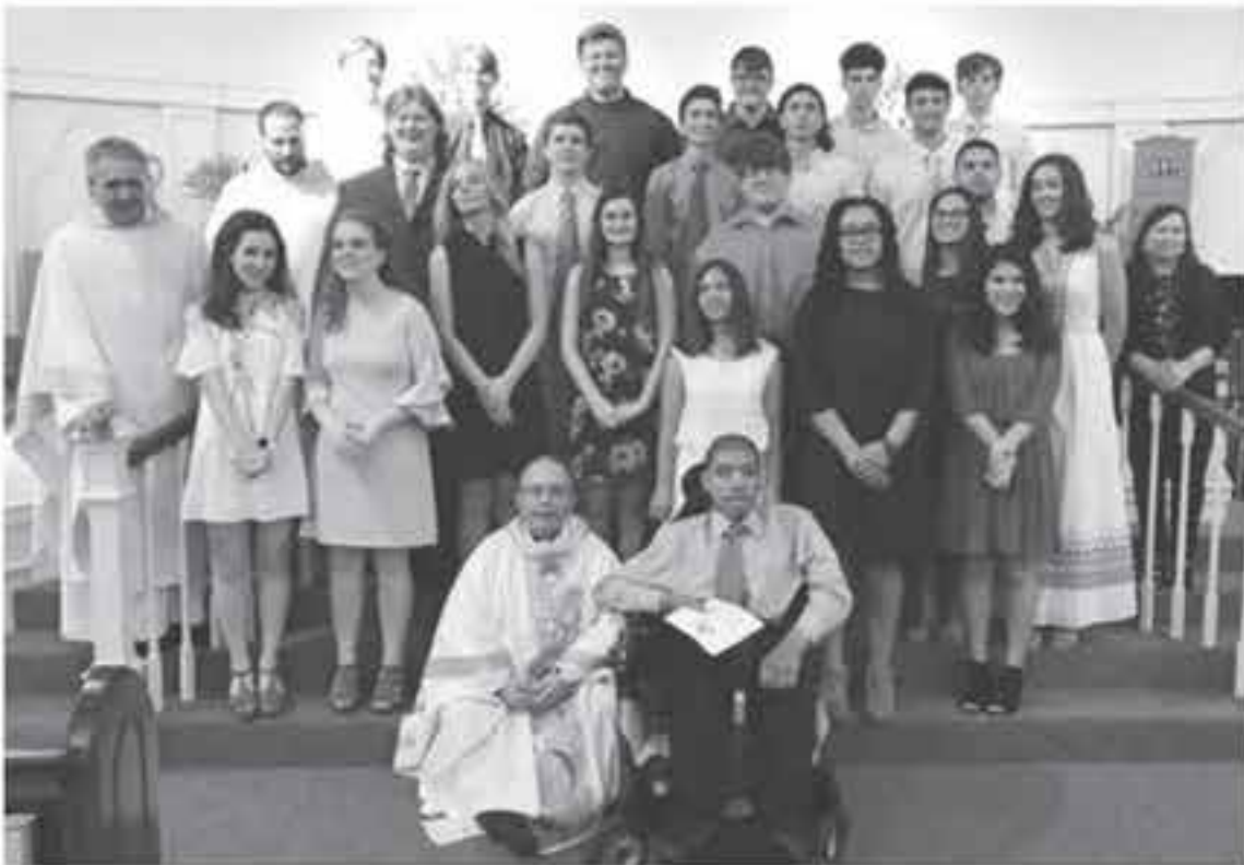
CONFIRMATION, ST. RITA CHURCH (Alexandria), April 6, 2018.