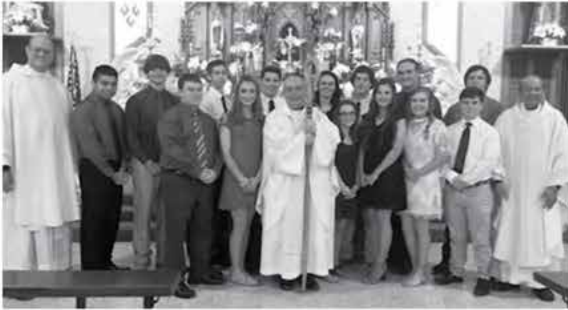
CONFIRMATION, MATER DOLOROSA CHURCH (Plaucheville), April 5, 2018.