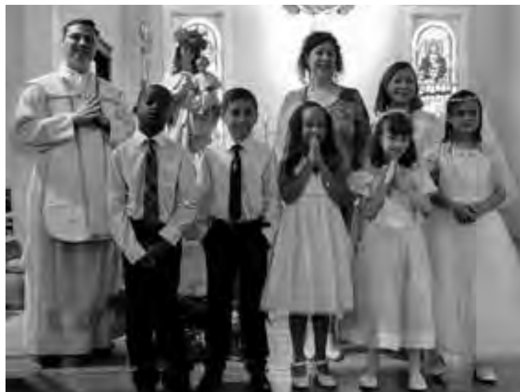
LEFT: FIRST COMMUNION AT ST. AUGUSTINE CATHOLIC CHURCH (Isle Brevelle) on May 6.