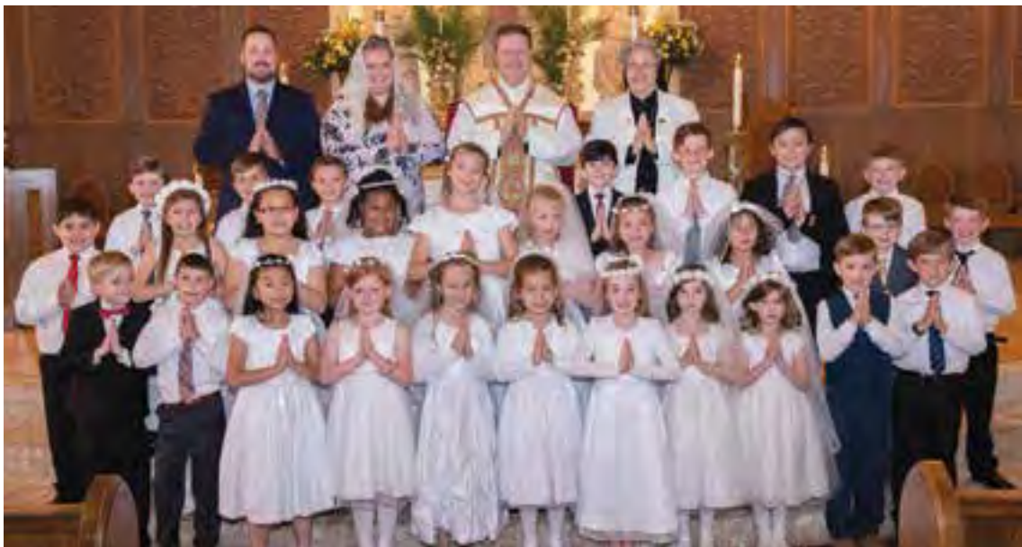
FIRST HOLY COMMUNION, ST. FRANCES CABRINI CHURCH (Alexandria)