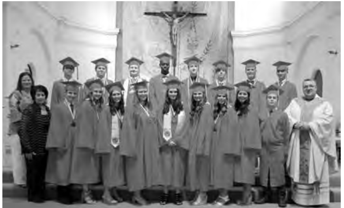
ST. ANTHONY OF PADUA SCHOOL (Bunkie) EIGHTH GRADE GRADUATION. 8th grade graduation was held May 18, 2018.