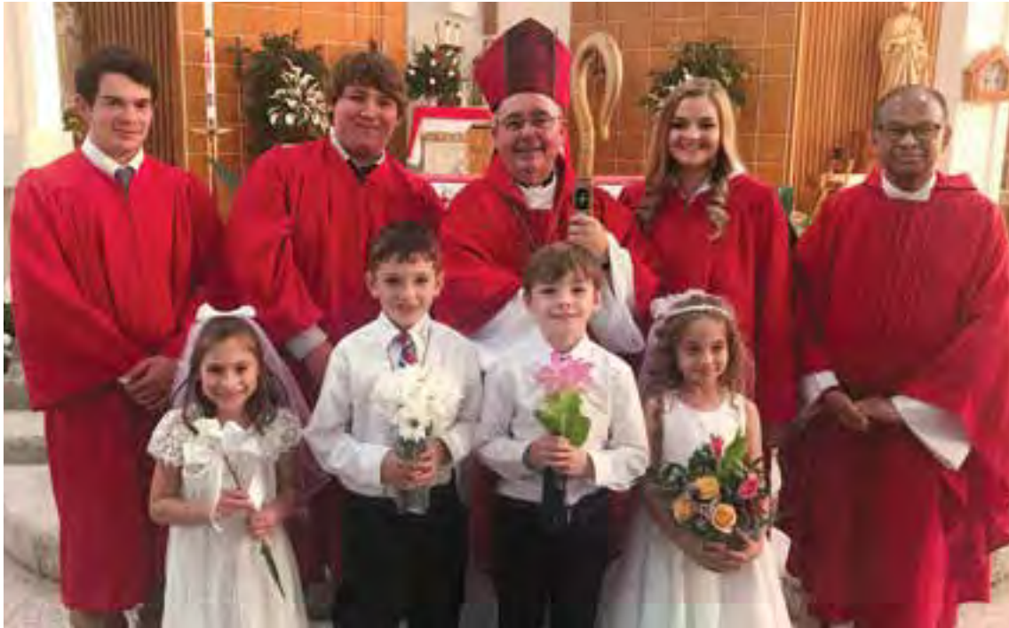
CONFIRMATION AND FIRST HOLY COMMUNION, ST. PETER CHURCH (Bordelonville) AND ST. MICHAEL CHURCH, (Rexmere), on Wednesday, May 9.