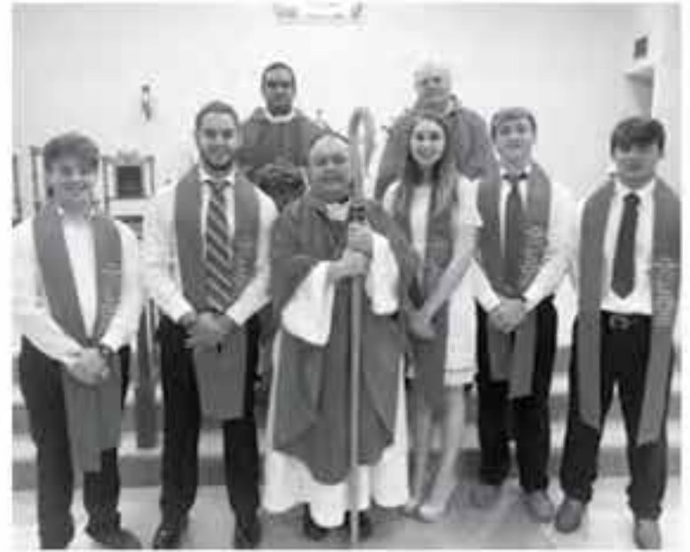
CONFIRMATION, STS. FRANCIS AND ANNE CHURCH (Kolin), May 23, 2018.