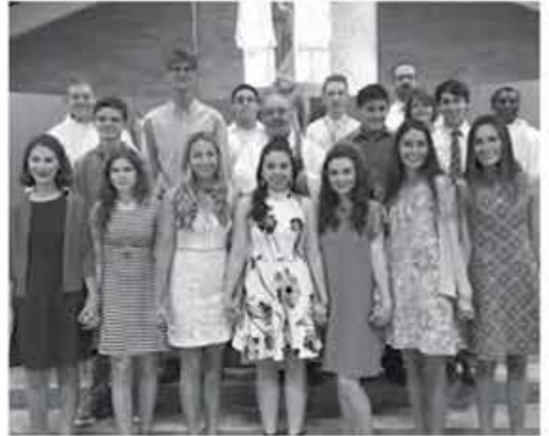
CONFIRMATION, SACRED HEART OF JESUS CHURCH (Pineville), on Sunday April 29.