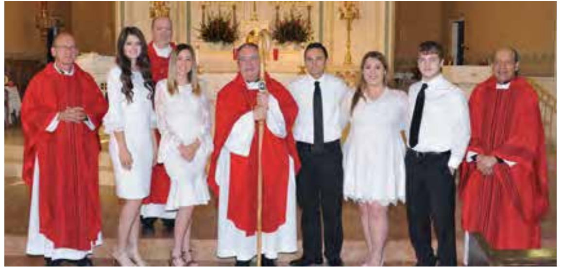
CONFIRMATION, ST. PAUL THE APOSTLE CHURCH (Mansura), April 26, 2018.