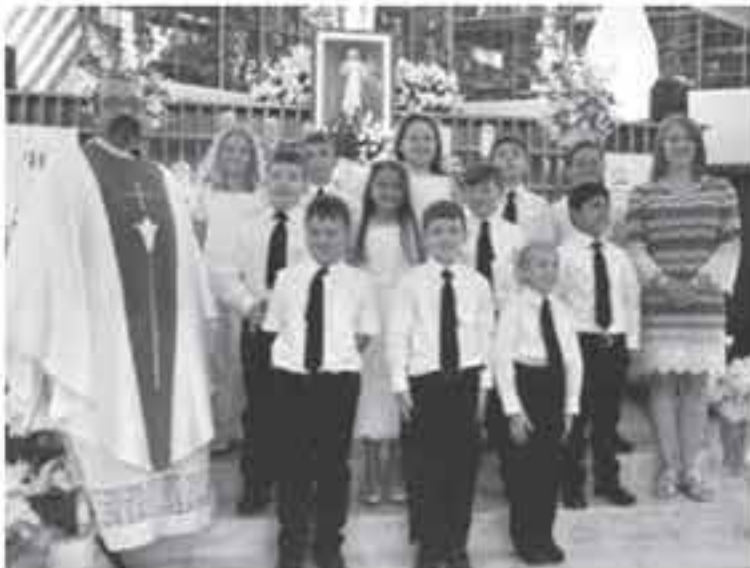
FIRST HOLY COMMUNION, ST. ALPHONSUS CHURCH (Hessmer).