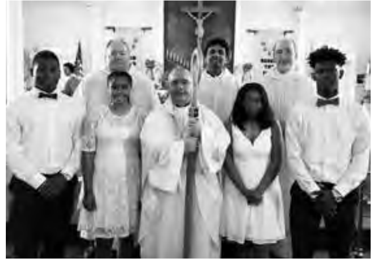
CONFIRMATION, HOLY GHOST CHURCH (Marksville) AND ST. RICHARDS CHAPEL (Hickory Hill) was held on May 27 at Holy Ghost Church.