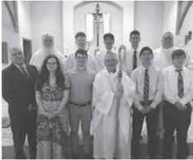
CONFIRMATION, IMMACULATE HEART OF MARY CHURCH (Tioga), on April 22.