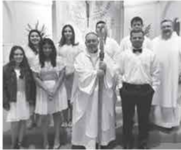
CONFIRMATION, ST. ANTHONY OF PADUA CHURCH (Bunkie), on April 7.