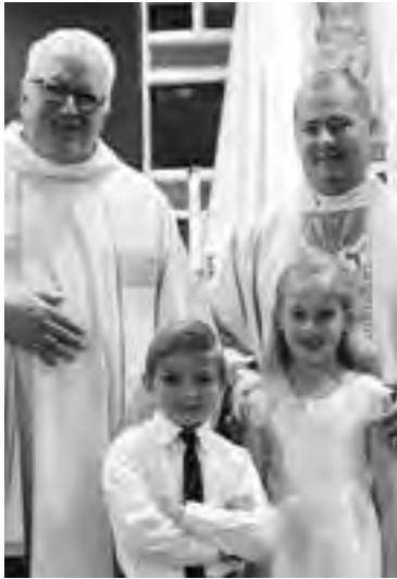
FIRST COMMUNION, MARY, MOTHER OF JESUS CHURCH (Woodworth), May 6.