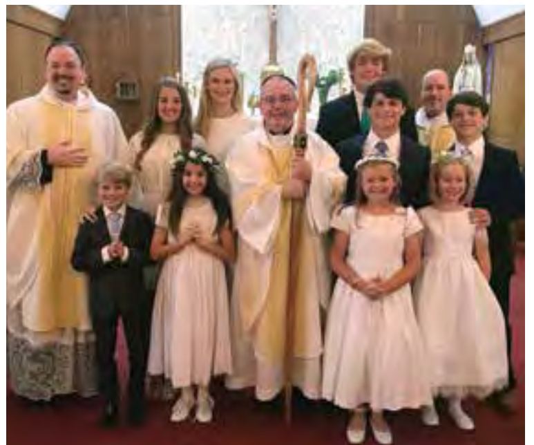
CONFIRMATION, ST. EDWARD THE CONFESSOR CHURCH (Tallulah) May 6, 2018. Those making their confirmation