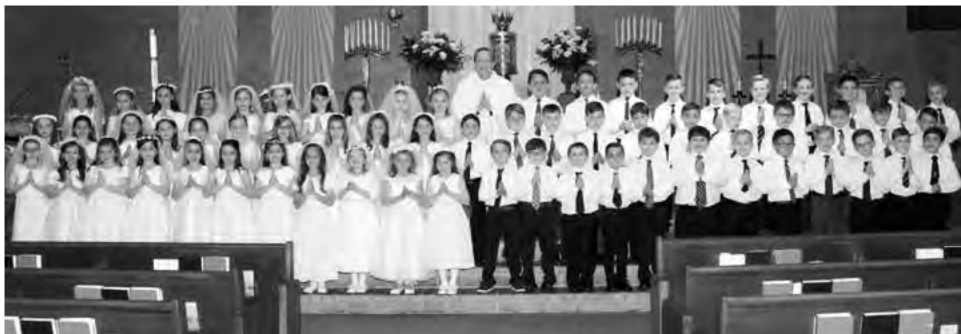
FIRST COMMUNION, OUR LADY OF PROMPT SUCCOR CHURCH AND SCHOOL (Alexandria). Sixty-four students made their First Holy Communion on April 21.