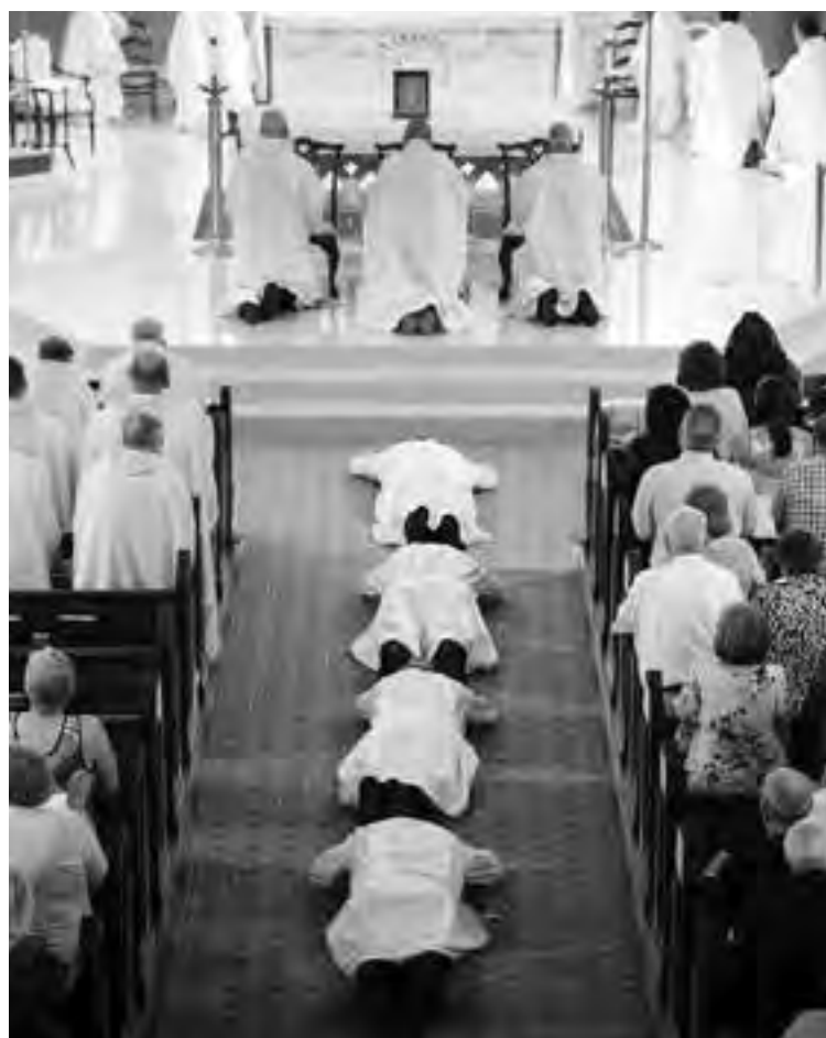
LAYING PROSTRATE. The deacon candidates lay facedown on the floor during the Litany as a sign of humility.