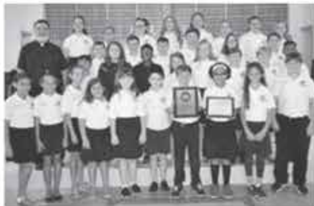
THE ST. MARY'S ASSUMPTION ELEMENTARY SCHOOL CHOIR participated in the 2018 Louisiana State Choir Festival in Shreveport and received a rating of Excellent in performance and a rating of Superior in Sightreading.