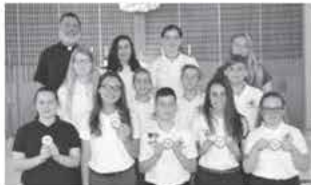
THE ST. MARY'S ASSUMPTION MIDDLE SCHOOL CHOIR received all Superior ratings at the 2018 Solo Ensemble Festival in Alexandria. Five students also made the 2018 District II Honor Choir.