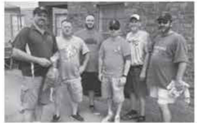
ST. MICHAEL THE ARCHANGEL (Leesville) CRAWFISH BOIL. The Knights of Columbus #4156 hosted a crawfish boil on Saturday, May 19 at St. Michael the Archangel Church in Leesville. All proceeds benefited the Permanent Diaconate program.