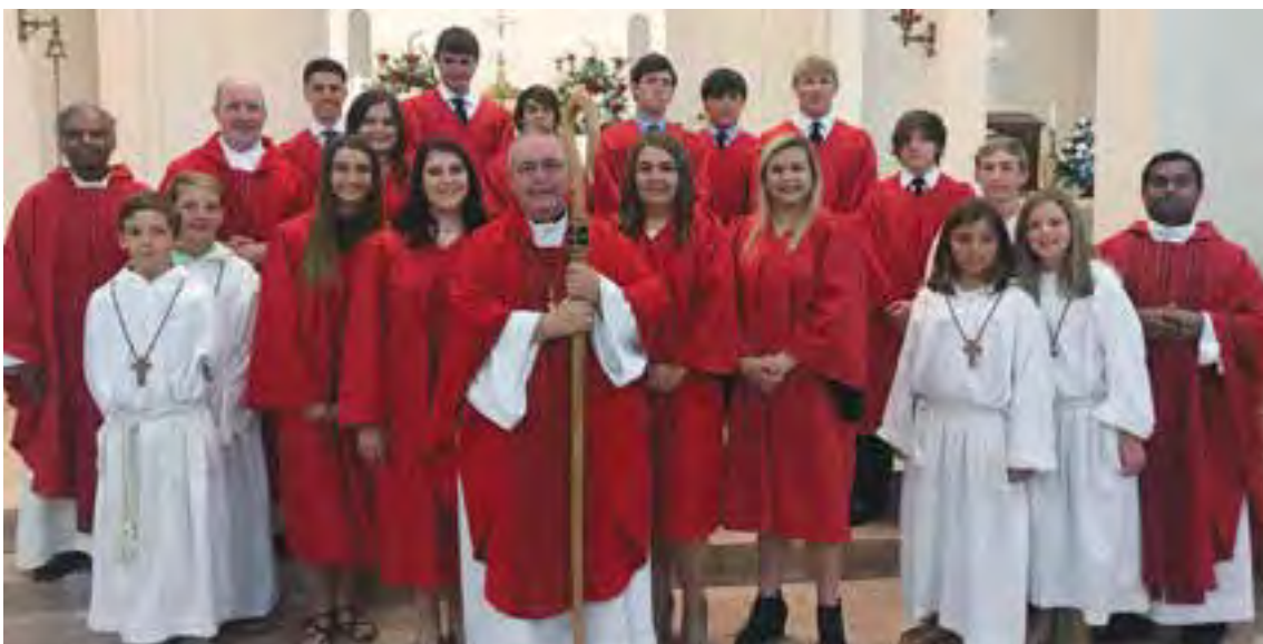
CONFIRMATION, SACRED HEART CHURCH (Moreauville), June 27.