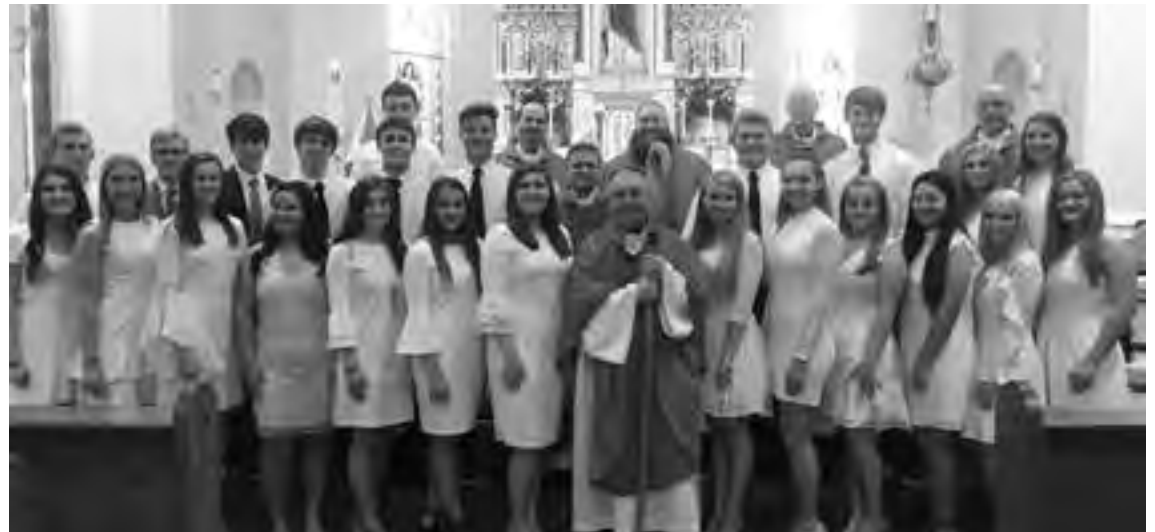
CONFIRMATION, MINOR BASILICA OF THE IMMACULATE CONCEPTION (Natchitoches), held Thursday, May 10.