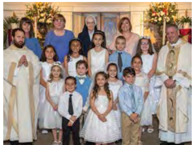
FIRST HOLY COMMUNION, ST. RITA CHURCH (Alexandria). St. Rita Church 2017-2018 Second Graders made their First Communion on Saturday, May 12, 2018.