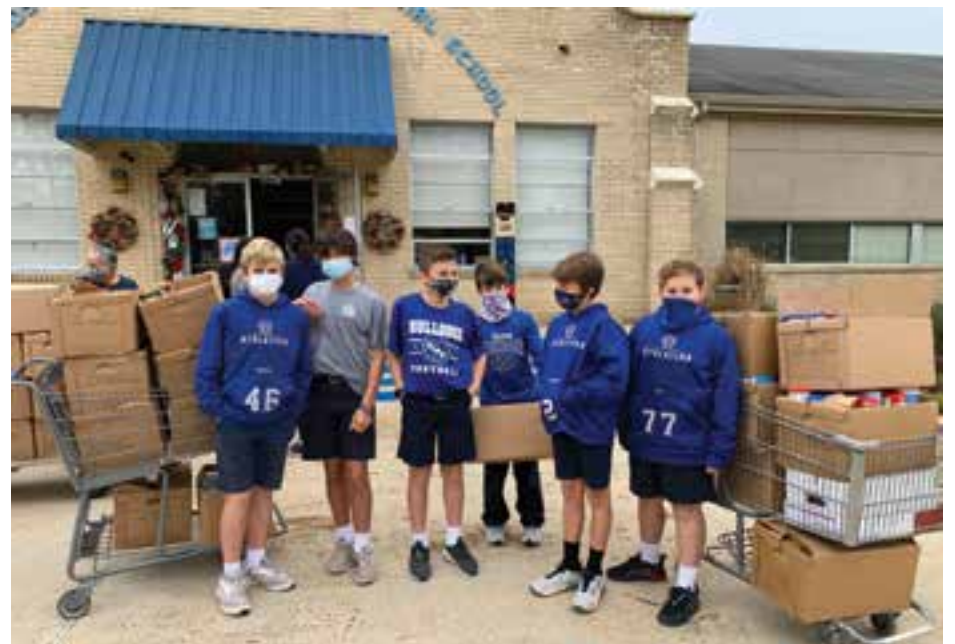
OUR LADY OF PROMPT SUCCOR SCHOOL FOOD PROCESSION. Our Lady of Prompt Succor School Food Drive was held on Friday, Dec. 4, with all classes participating. Food was collected to go to the Church Christmas Cheer program that will provide food and gifts to close to 75 families. At the end, some of the 6th grade boys helped to sort, gather, and move all of the food. Once again, our parents were so generous with their donations to those in need during this difficult time.