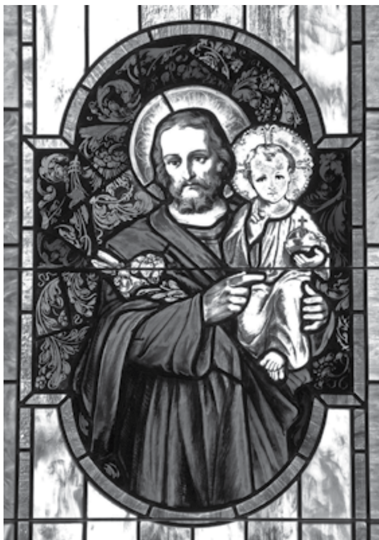
ST. JOSEPH AND THE CHRIST CHILD. St. Joseph and the Christ Child are depicted in a stained-glass window at Immaculate Conception Church in Westhampton Beach, N.Y. In a Dec. 8 apostolic letter, Pope Francis proclaimed a yearlong celebration dedication to St. Joseph, foster father of Jesus.

Matthew and Luke, the two evangelists who speak most of