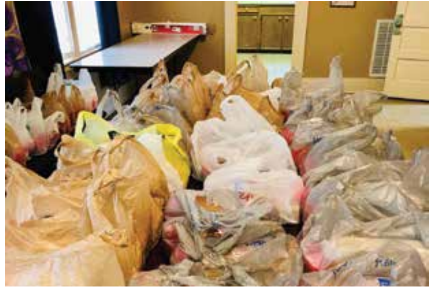
ST. TIMOTHY FOOD PANTRY. Our Lady of Prompt Succor Church, Alexandria, as part of Thanksgiving weekend, held their monthly distribution of free foods. Persons in need who ask, receive a bag of no-cook foods (peanut butter, canned tuna and chicken, etc.) or cook-foods (beans, rice, pasta, soups), plus a bag of bread and crackers. Approximately 110-150 or more food bags are normally handed out. Pictured above are some of the food bags that were prepared and distributed.