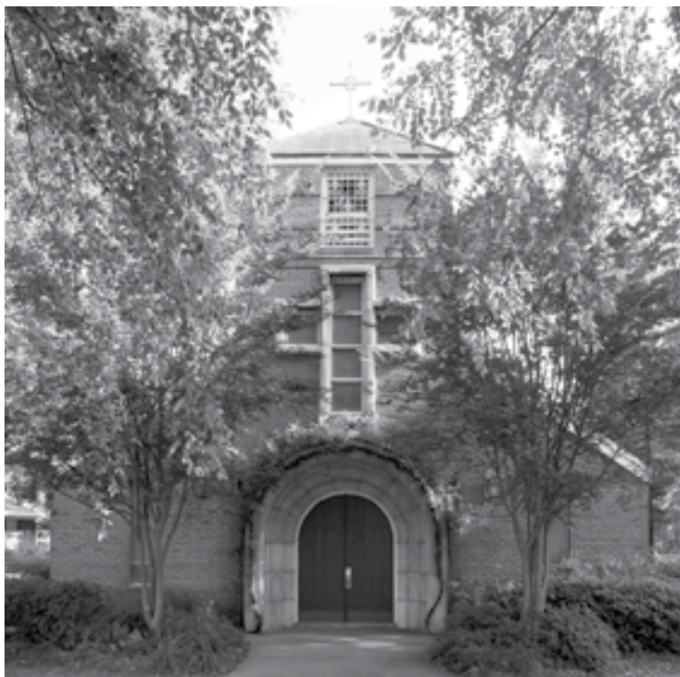
ST. EDWARD THE CONFESSOR CHURCH, TALLULAH.

The small chapel in Tallulah served as a mission of Lake Providence from 1911 to 1936.