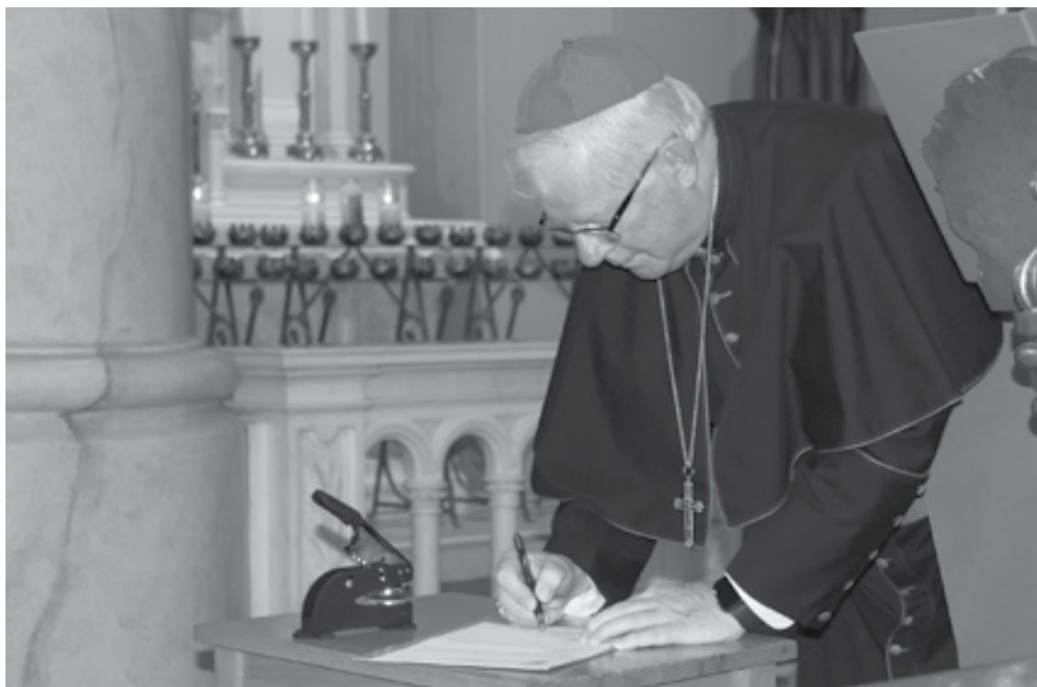
SHREVEPORT BISHOP FRANCIS I. MALONE. Bishop Francis I. Malone of Shreveport, La., signs a decree of recognition Dec. 8, 2020 at Holy Trinity Catholic Church in downtown Shreveport, officially opening a sainthood cause for five priests who died ministering to people during the yellow fever epidemic of 1873.

In the late summer of 1873, Shreveport was besieged by the third-worst epidemic of yellow fever recorded in U.S. history,