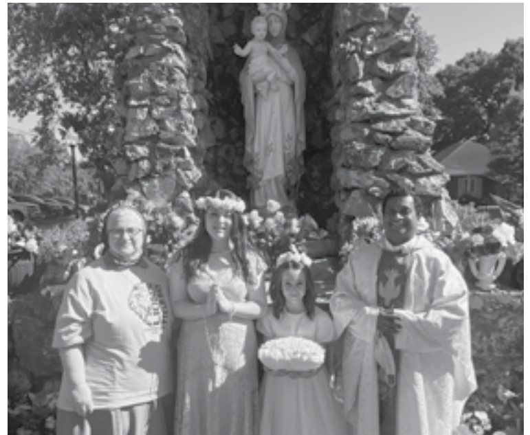
MAY CROWNING, SACRED HEART SCHOOL, MOREAUVILLE.