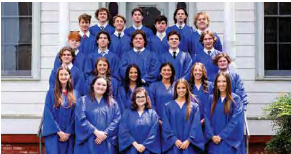
CLASS OF 2021, ST. MARY'S SCHOOL, NATCHITOCHE. Graduation was held Sunday, May 16 in the Natchitoches Event Center.