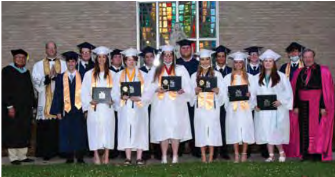
CLASS OF 2021, ST. JOSEPH'S HIGH SCHOOL, PLAUCHEVILLE. Graduation was held Wednesday, May 12 at Mater Dolorosa Church, Plaquemine.