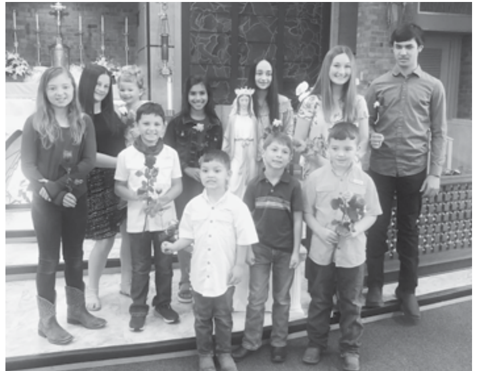
MAY CROWNING, ST. FRANCIS DE SALES, ECHO.

View recorded Mass on YouTube: St. Anthony of Padua Church , Natchitoches