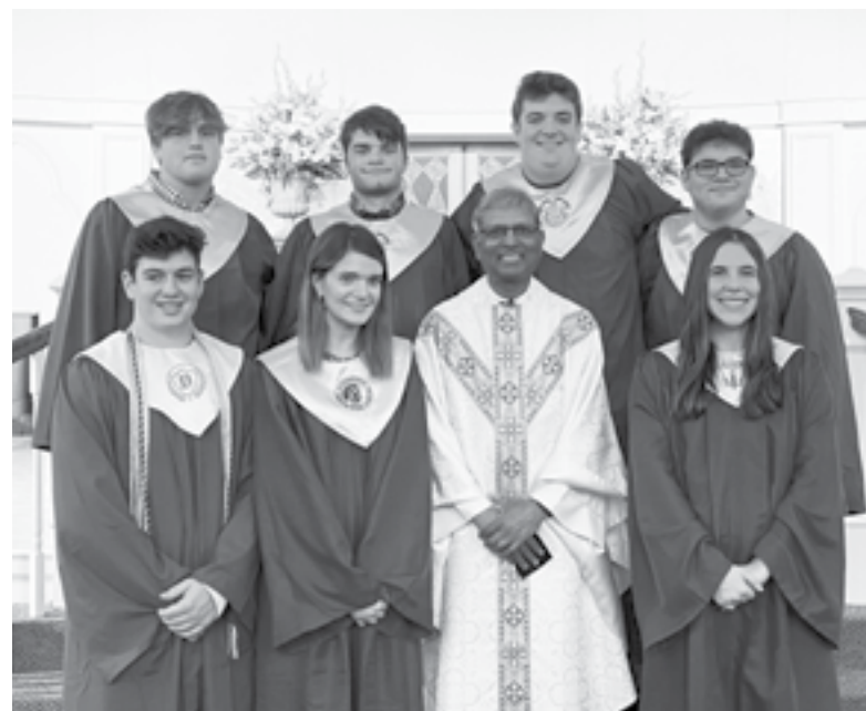
BACCALAUREATE MASS, ST. RITA, ALEXANDRIA. Mass was celebrated for the graduating high school seniors of St. Rita Church on May 2.