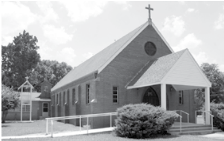
OUR LADY OF SORROWS CHURCH CIRCA 2010.