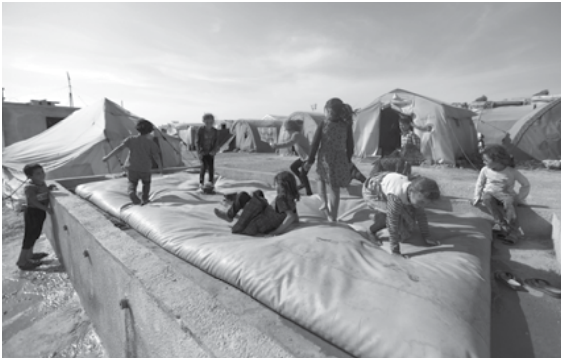
DISPLACED SYRIANS CAMP. Internally displaced Syrian girls play together at Teh camp in northern Idlib, Syria, May 5, 2021.

"It is time for all people of goodwill, especially Catholics in Western nations, to