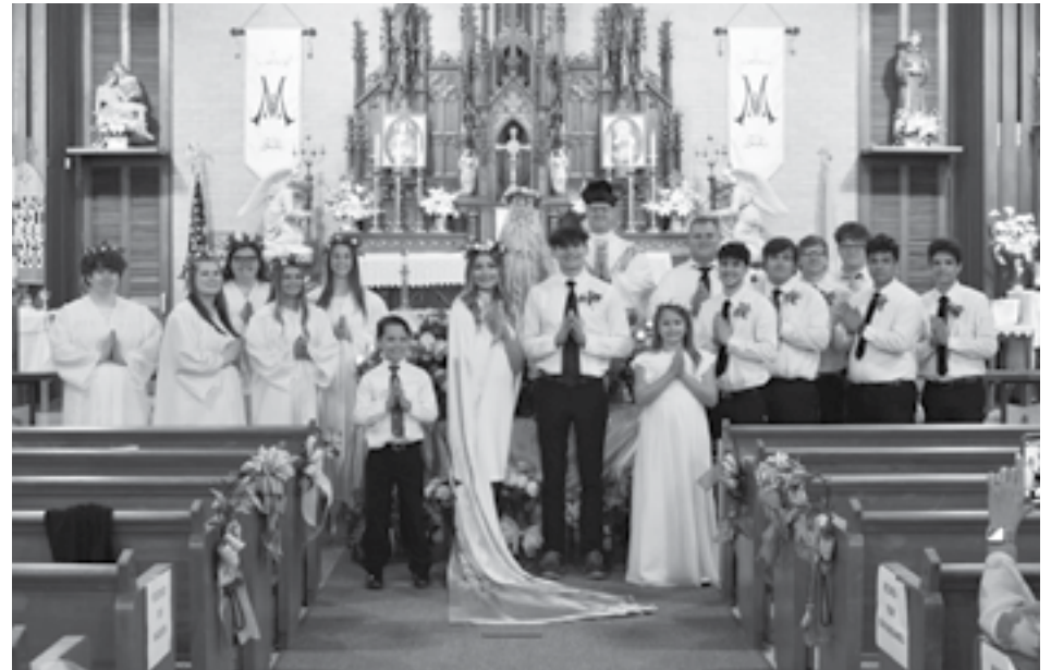
MAY CROWNING, MATER DOLOROSA CHURCH, PLAUCHEVILLE.