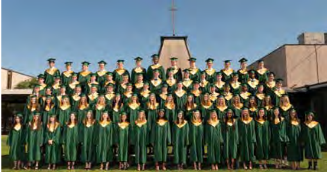
CLASS OF 2021, HOLY SAVIOR MENARD CENTRAL HIGH SCHOOL. Menard graduation was held Tuesday, May 11 in the auditorium of the Pentecostals of Alexandria.