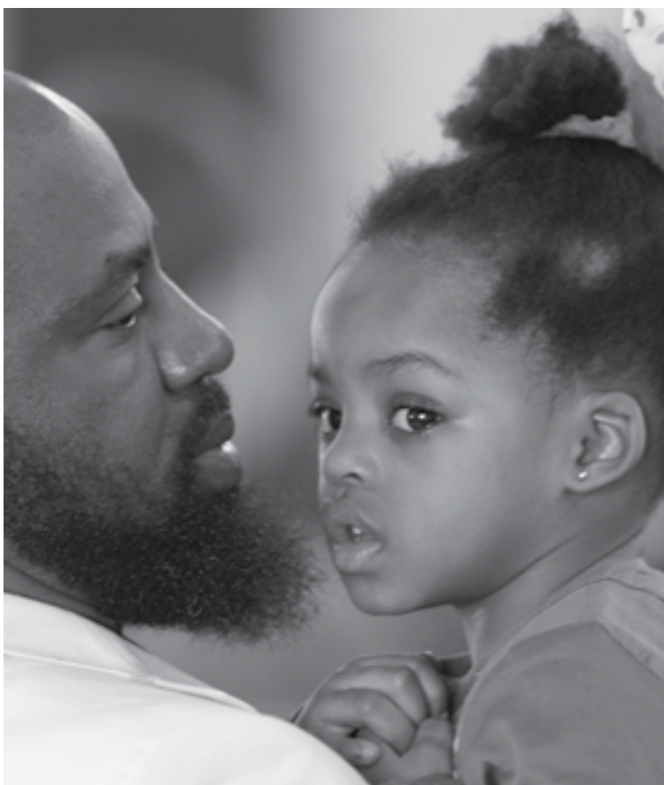
FATHER'S DAY GIVING. A father looks at his daughter during Palm Sunday Mass at Our Lady of the Sea Church in Solomon, Md. The invitation to move outside of the self to the other is the divine pedagogy of fatherhood.