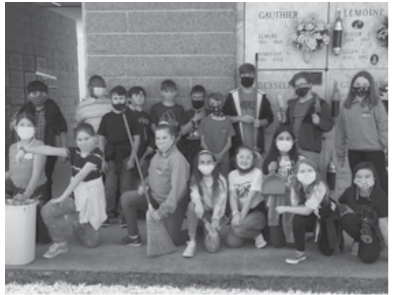
SACRED HEART SCHOOL, MOREAUVILLE. SHS students adopted the Sacred Heart Church Mausoleum, graveyard, and grotto in the efforts to help the town get prepared for the Cleanest City Contest held in May.