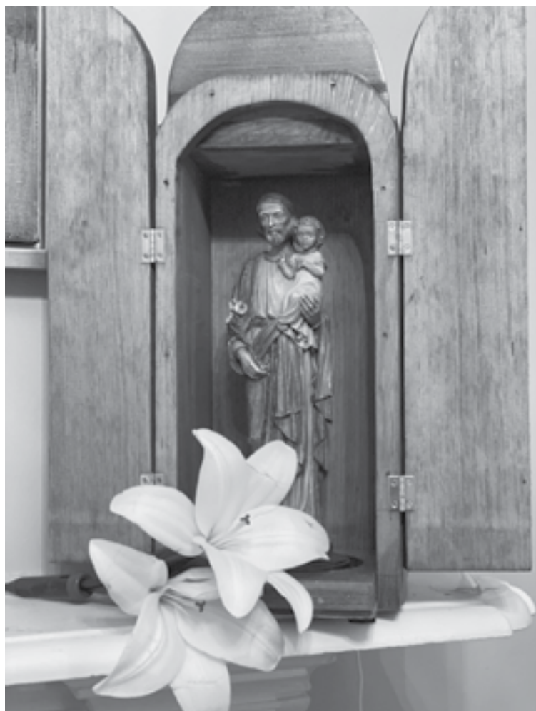
TRAVELING ST. JOSEPH, OUR GUARDIAN. The wooden statue is small enough to be placed on a table or fireplace mantel. The case is hand made and closes for safe keeping during transporting the statue.