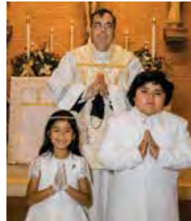
ST. MARY'S CATHOLIC CHURCH, WINNSBORO, FIRST COMMUNION, First Holy Communion was held May 9.