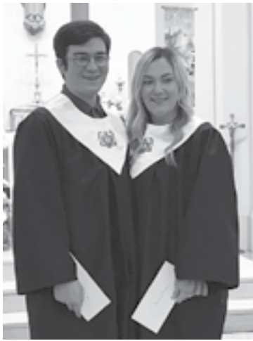
CATHOLIC YOUTH LEADERSHIP. Sacred Heart Church (Moreauville) high school graduate recipients of the CYLA (Catholic Youth Leadership Award) scholarship,