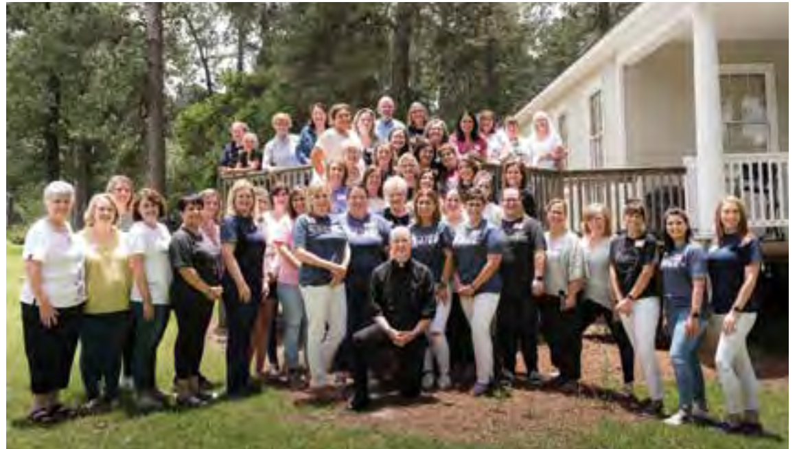
WOMEN'S DAY OF REFLECTION. A Day of Reflection was held at Maryhill Renewal Center on June 5.