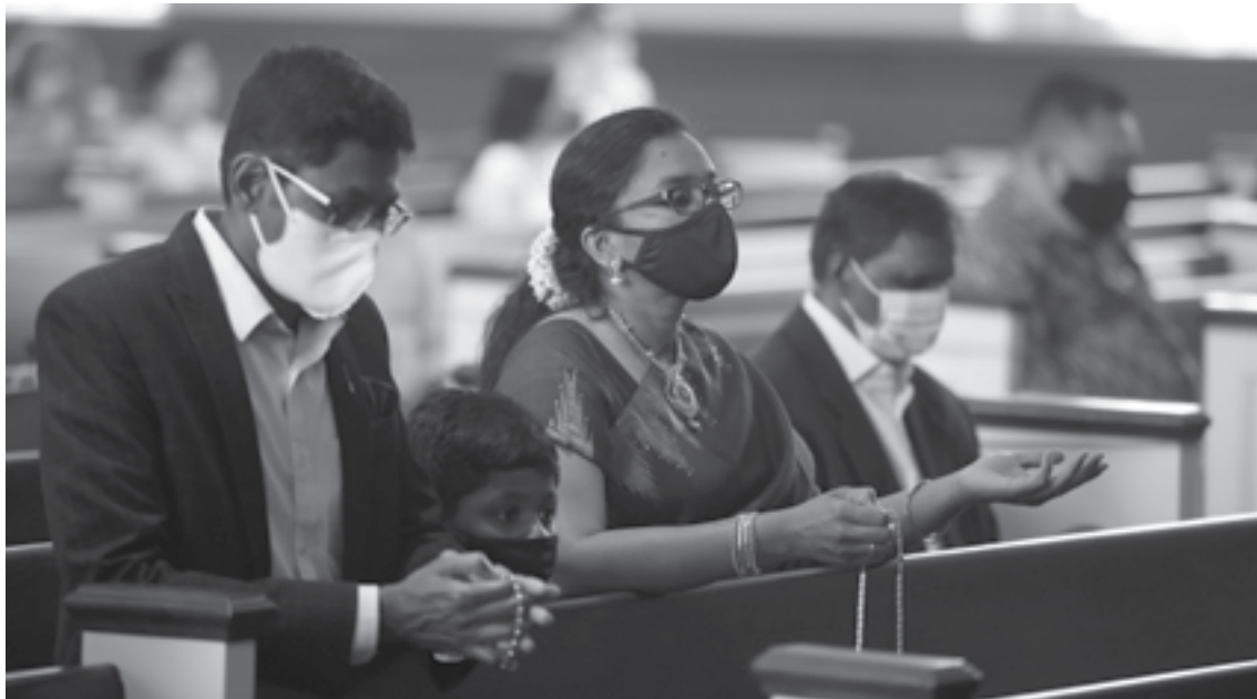
FORGIVENESS FAMILY. A family prays at St. Michael the Archangel Church in Silver Spring, Md., during the Asian and Pacific Island Catholic Marian Pilgrimage May 1, 2021. What could be more necessary to grow in holiness than the embrace of an attitude that says, “I will love this person and forgive them, because I know they forgive me”?