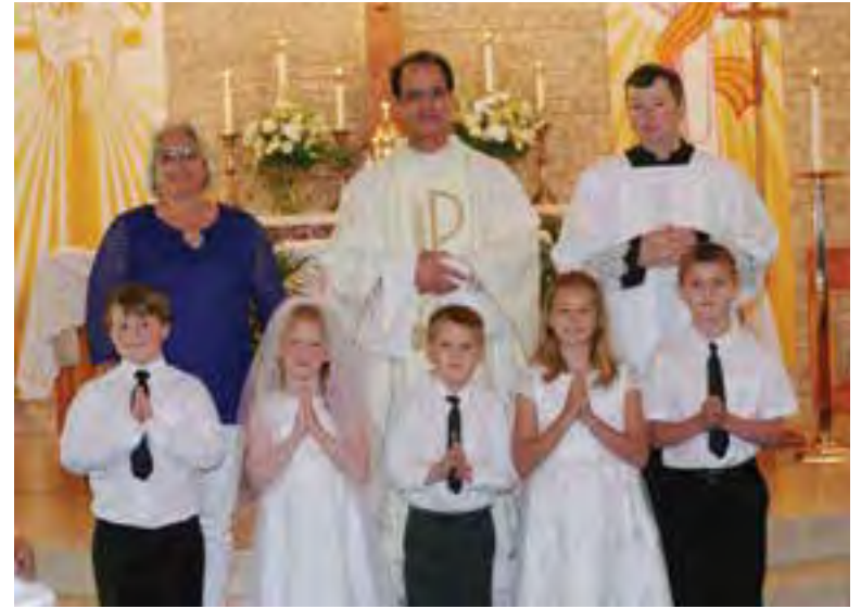
FIRST HOLY COMMUNION, ST. JOHN THE BAPTIST IN DEVILLE. Sunday, May 16.