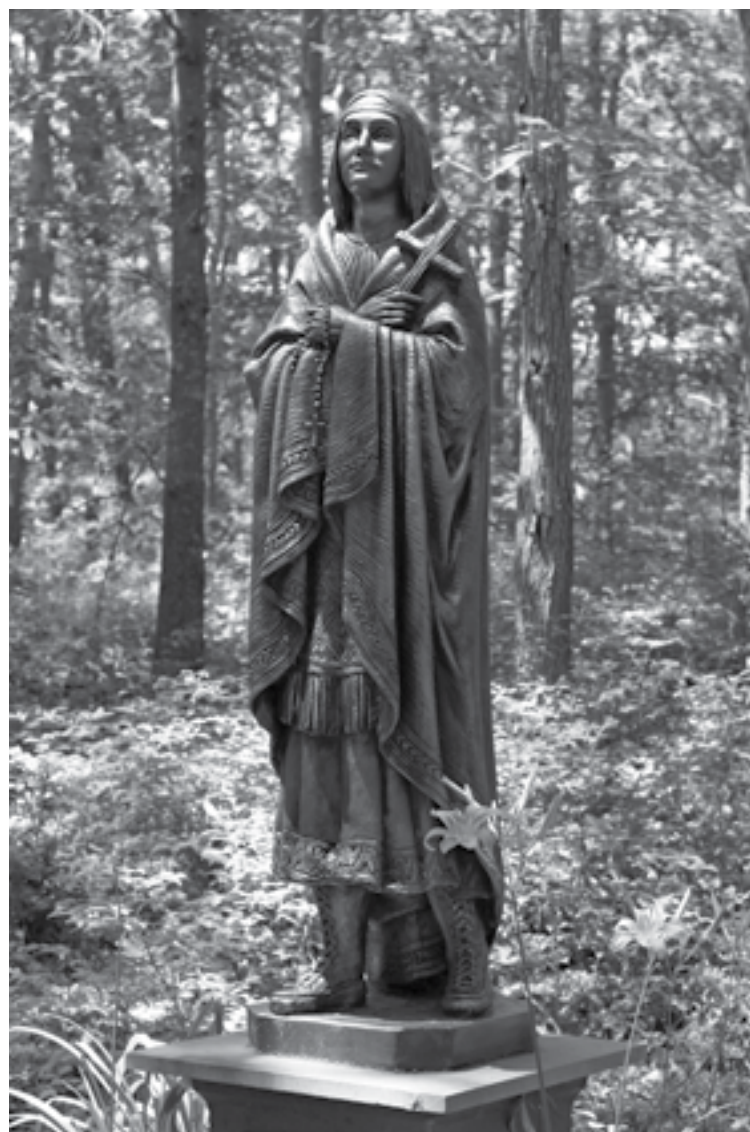
ST. KATERI TEKAKWITHA. A statue of St. Kateri Tekakwitha, above, is seen at Our Lady of the Island Shrine in Manorville, N.Y. The saint's feast day is celebrated July 14 in the U.S. and April 17 in Canada.

Under the pontificate of Pope John Paul II, she was beatified in 1980 and canonized by Pope Benedict XVI in 2012, and is known as "the Lily of the Mohawks."