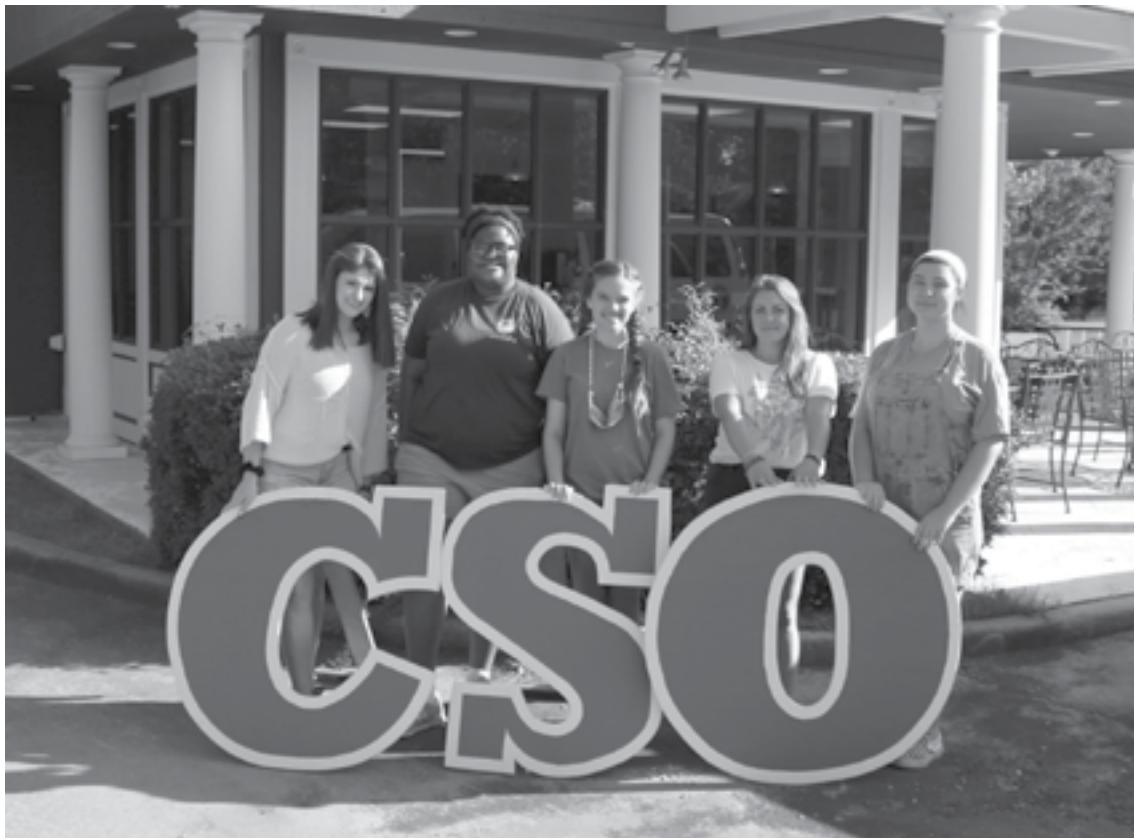
FOCUS MISSIONARY GROUP serves students on the campus of Northwestern State University.

Encouraged and driven by Pope St. John Paul II's call to a New Evangelization, and encouraged with steadfast hope to change the culture for Christ, FOCUS has forged ahead into the battlefield. FOCUS missionaries have spread the gospel message to tens of thousands of college students