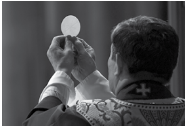
EUCCHARISTIC RENEWAL. A priest elevates the host during a Mass at St. Patrick's Cathedral in New York City in 2020.

Some are more positive: the resurgence of eucharistic adoration among Catholic youth;