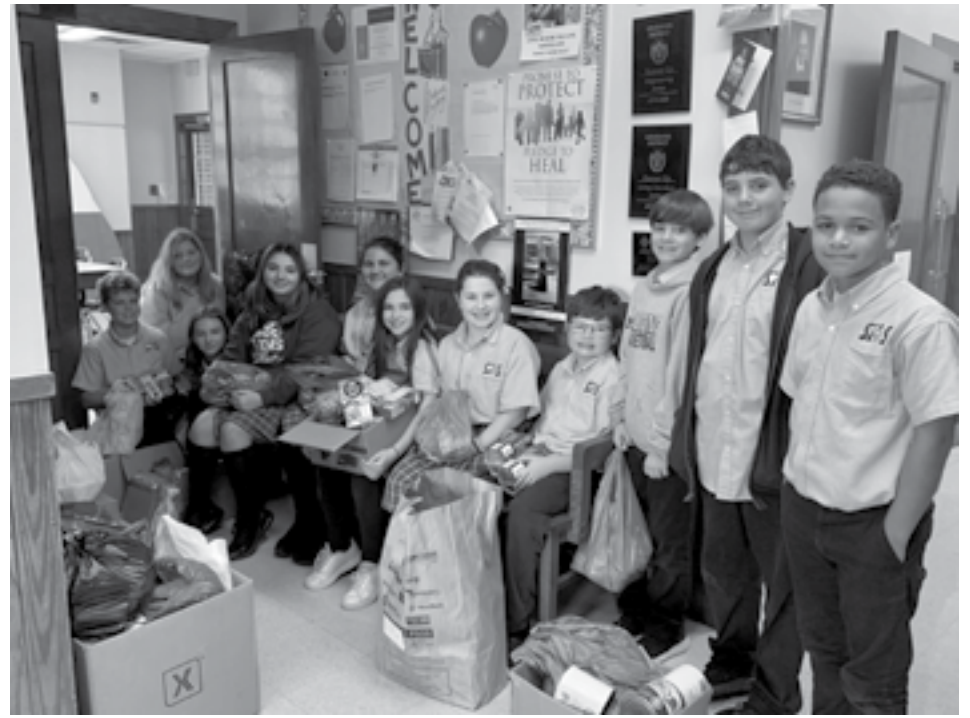
SACRED HEART SCHOOL FOOD DRIVE. SHS's 4-H Club participated in the 2021 Christmas Cheer Food Drive. 4-H members in 6-8 grades are pictured boxing up supplies for the Food Bank. Thanks to all of our SHS families and friends for their generous donations of non-perishable foods. Merry Christmas from SHS's 4-H club! ...