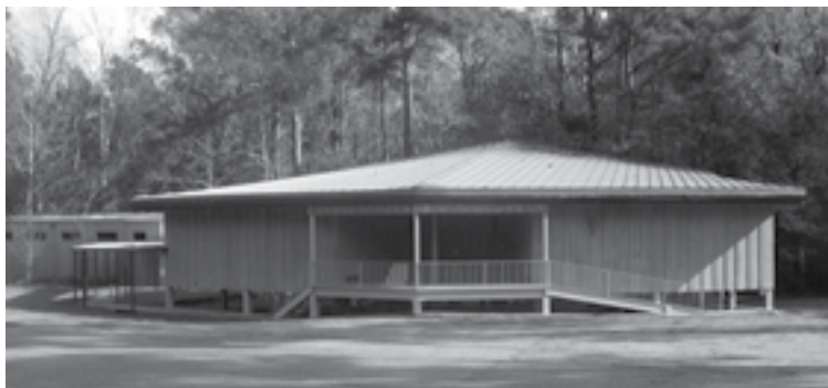
ST. EDWARD MISSION, FISHVILLE