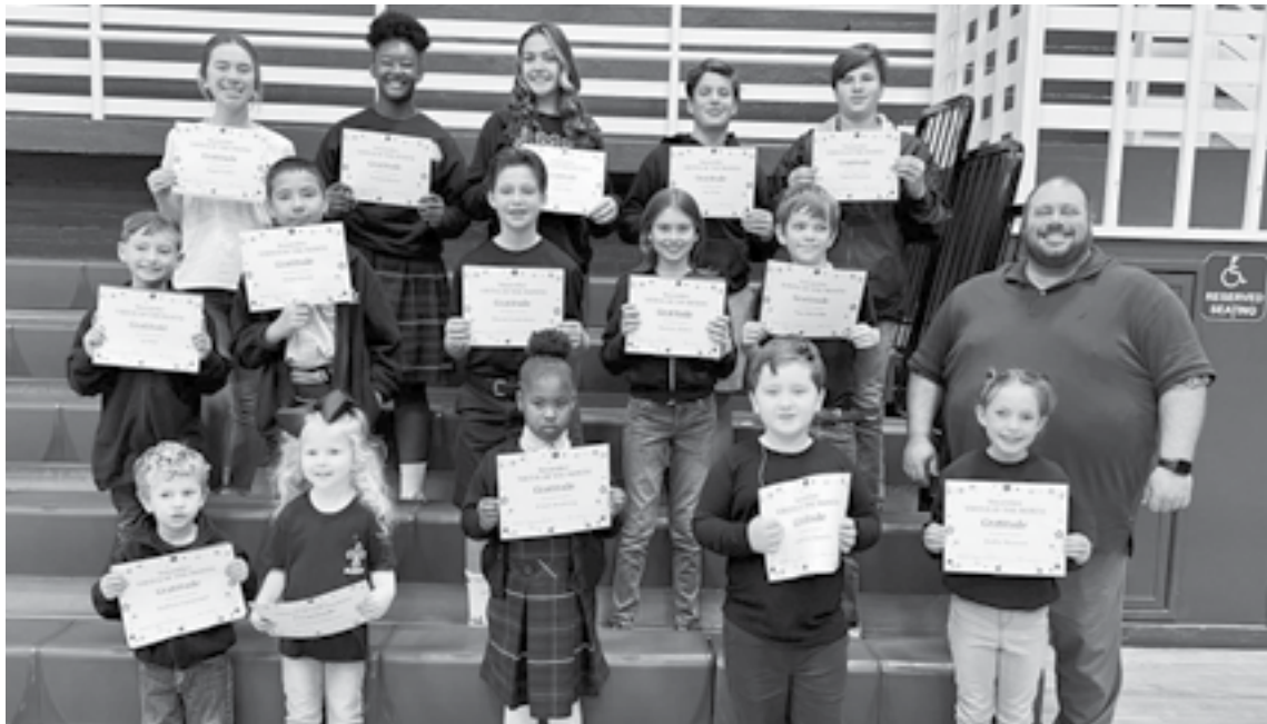
ST. MARY'S SCHOOL VIRTUE OF THE MONTH: GRATITUDE. The Virtue of the Month for November was Gratitude. Students from St. Mary's Catholic School in Natchitoches