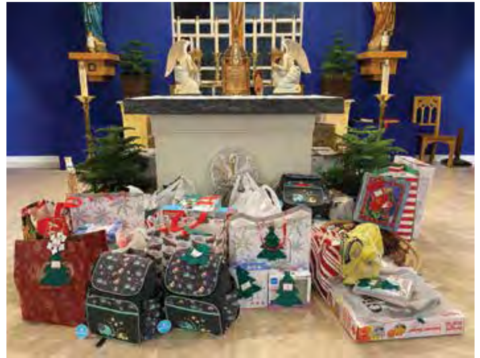
MARY, MOTHER OF JESUS CHURCH, WOODWORTH. Parishioners of Mary, Mother of Jesus Church, Woodworth donated items to this year's Giving Tree project. The gifts are earmarked for seminarians and for the Cenla Pregnancy Center.

View more photos on the photo galleries at www.diocesealex.org .