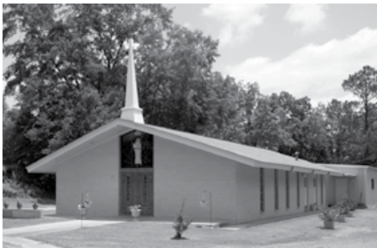
ST. MARY CHURCH, JENA

Over the years a parish hall was added to the complex. In recent years the rectory was renovated with help from the men of the parish and a new stained glass window was added to the church. This parish also serves the mission Church of St. Edward's in Fishville.