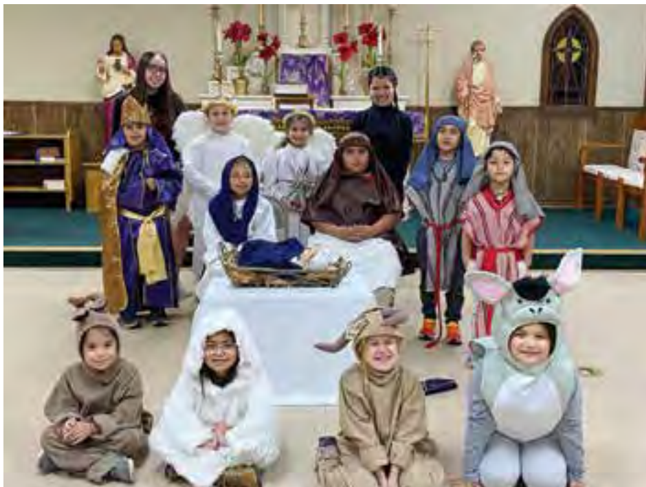
OUR LADY OF LOURDES, WINNFIELD. (ABOVE) On Dec. 8, the children of Our Lady of Lourdes Catholic Church performed their Christmas programs. The catechism classes performed "The First Christmas." The youth group did a black light show to "Little Drummer Boy!" (RIGHT). The performances were outstanding! Following the shows, the congregation enjoyed a delicious meal. The church enjoyed an evening filled with the true Christmas spirit.