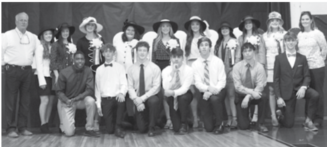
ST. JOSEPH SCHOOL HOMECOMING WEEK. St. Joseph School celebrated their Homecoming Week, Nov. 29 - Dec. 4. The week was filled with many events, including different out-of-uniform days, parade through the town of Plaquemine, pep rally, winning games against False River Gators, and the homecoming dance. The following students were on the Homecoming Court: