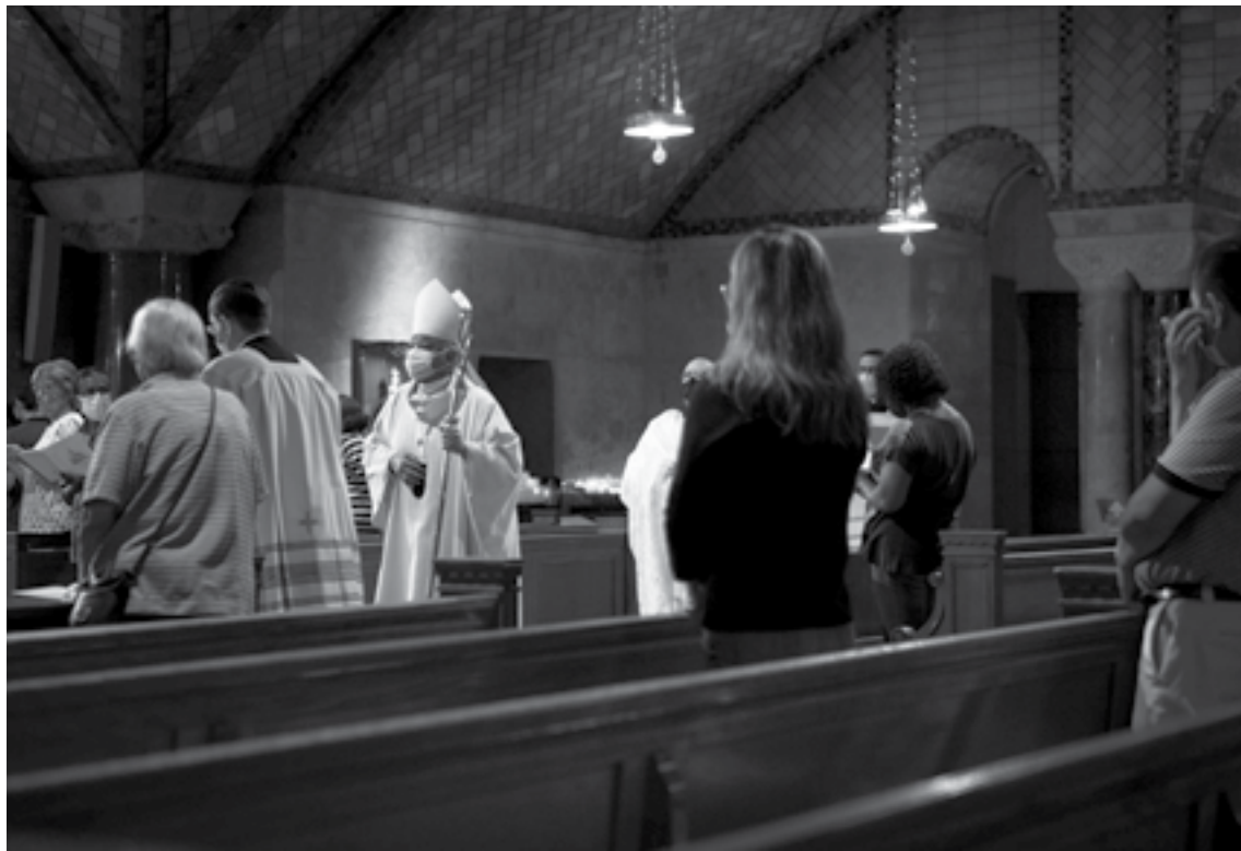
CATHOLIC POPULATION. Washington Cardinal Wilton D. Gregory processes into Mass in the Crypt Church at the Basilica of the National Shrine of the Immaculate Conception in Washington Sept. 16, 2021. The percentage of Catholics in the U.S. population in 2021 held steady at 21% in the latest Pew Research Center survey, issued Dec. 14.

The dip in the percentage of Catholics is less pronounced; it was 24% in 2007 and 14 years later is 21%. The Orthodox churches make up about 1% of Americans, and members of the