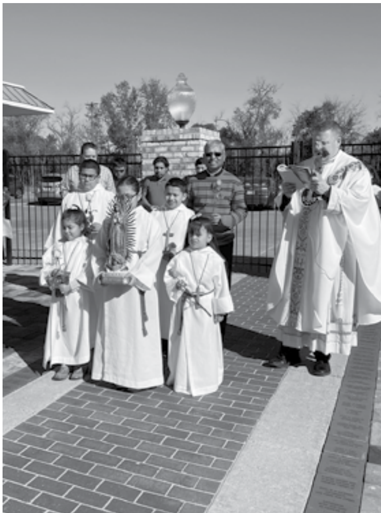
ST. RITA CHURCH, ALEXANDRIA. St. Rita Church Spanish Community celebrated Our Lady of Guadalupe with a procession before Mass on Sunday, Dec. 12, the Feast of Our Lady of Guadalupe.

On the miraculous tilma, Mary is shown as a young native woman—not Spanish or European. Her dress—with jasmine, a fur-trimmed neck and cuffs, and a gold border on her cape—would have told the Aztec people that this woman was an Aztec princess or queen.