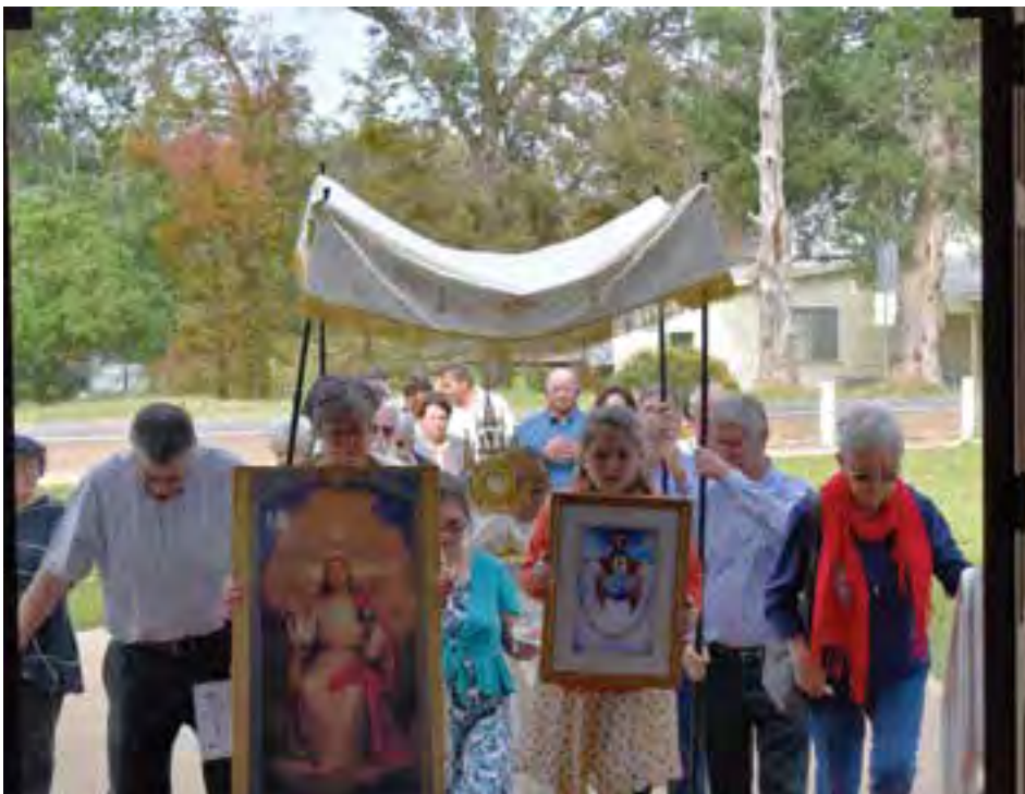
CHURCH OF THE LITTLE FLOWER, EVERGREEN. Parishioners from Church of the Little Flower in Evergreen participated in a procession with the Blessed Sacrament outside of the church on Nov. 21, the Feast of Christ the King.

View more photos on the photo galleries at www.diocesealex.org .