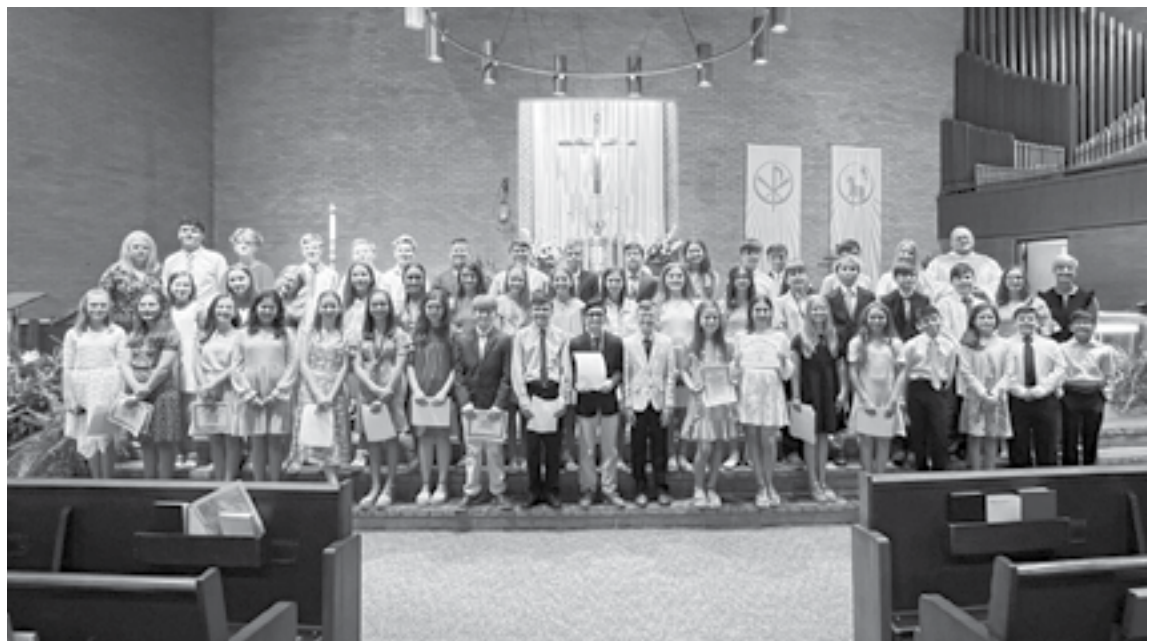
Sacred Heart School D.A.R.E. Graduates:

Catholic Campus Ministry is provided at LSU of Alexandria, Louisiana College, and Northwestern State University.