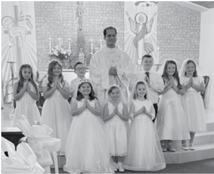
FIRST HOLY COMMUNION, ST. JOHN THE BAPTIST, DEVILLE. First Communion Mass was celebrated April 24.