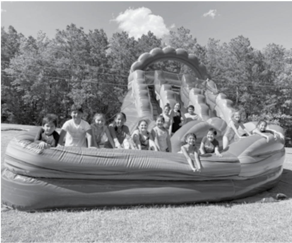
OUR LADY OF LOURDES END OF YEAR CCD PARTY. The catechism classes of Our Lady of Lourdes Church in Winnfield celebrated the end of their catechism year with a waterslide party. The children enjoyed hours of playing in the water.