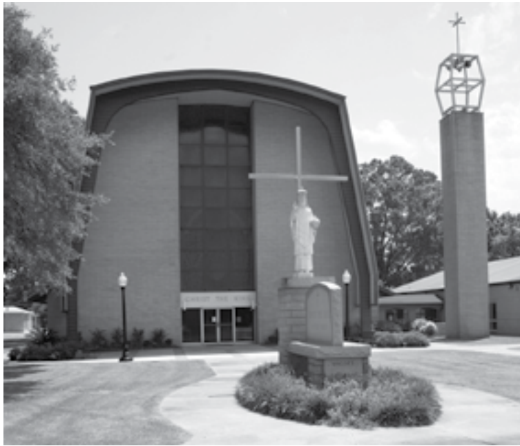
CHRIST THE KING CHURCH, SIMMESPORT.