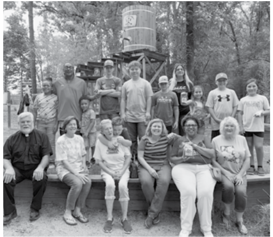
FAMILY FUN DAY. Nativity of Blessed Virgin Mary annual CCD Family Fun Day. The students, parents, and teachers enjoyed a fun filled afternoon at Lost Treasure Mining. At our outing on May 15, the children received certificates, played games, enjoyed lunch, and learned how to mine and identify the gemstones they found.