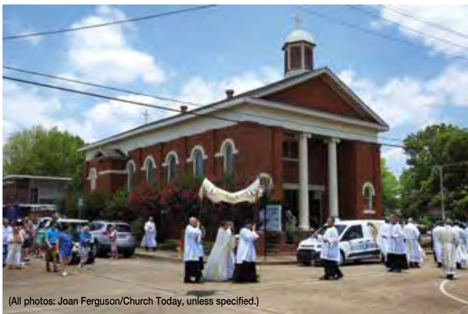
(All photos: Joan Ferguson/Church Today, unless specified.)