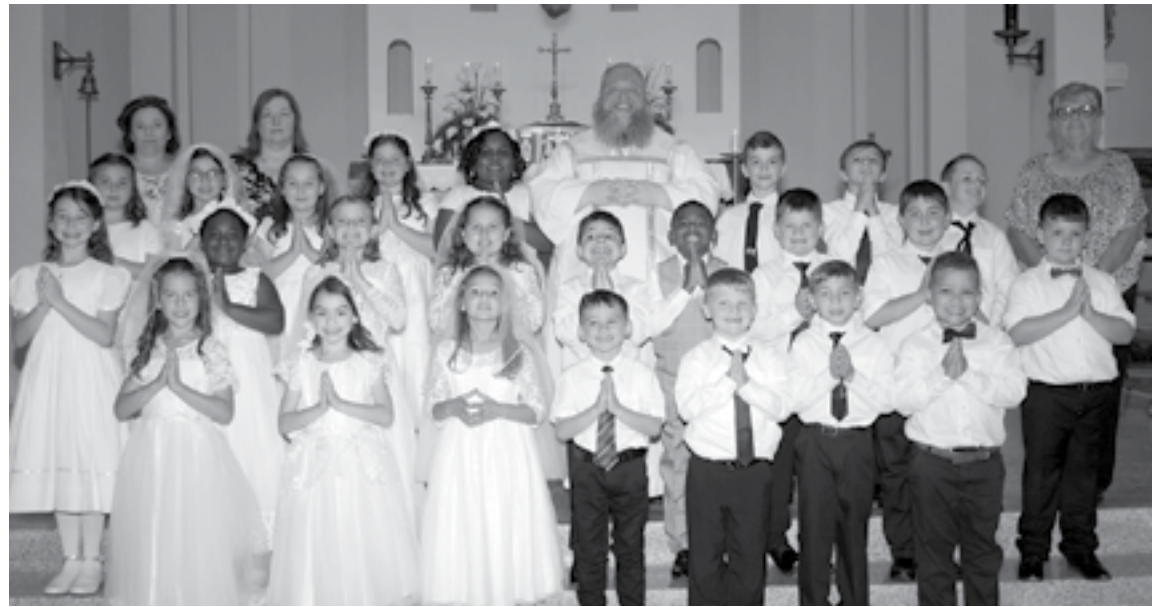
FIRST HOLY COMMUNION, MOREAUVILLE. Sacred Heart Church in Moreauville held its First Communion Mass on Saturday, May 7.