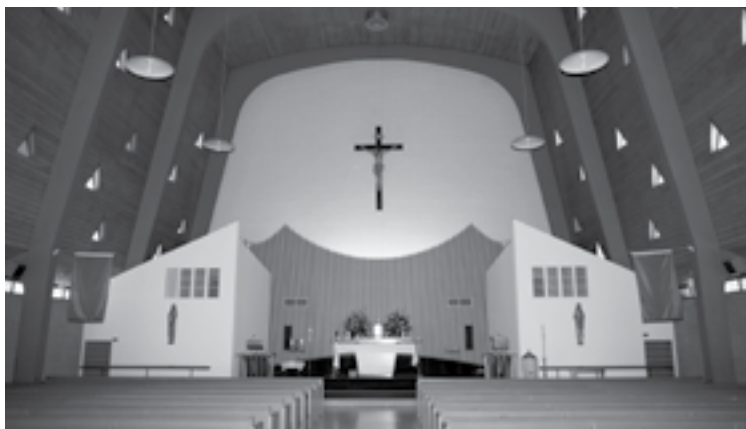
INTERIOR OF CHRIST THE KING CHURCH, SIMMESPORT.