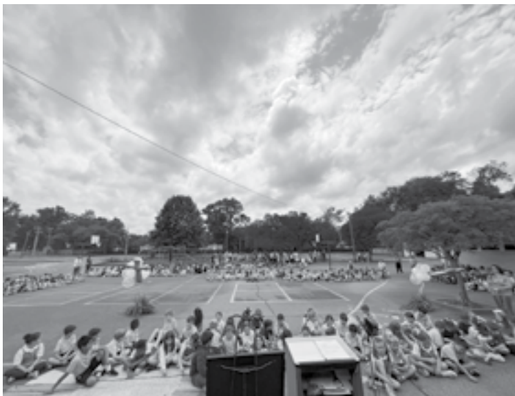
OUR LADY OF PROMPT SUCCOR SCHOOL PRAYER SERVICE. On Thursday, May 5, 2022, the school gathered together for a prayer service for our 2nd grade students in honor of their receiving their First Communion! It was a beautiful day with school and family celebrating our 2nd graders on the occasion of receiving the Most Blessed Sacrament.