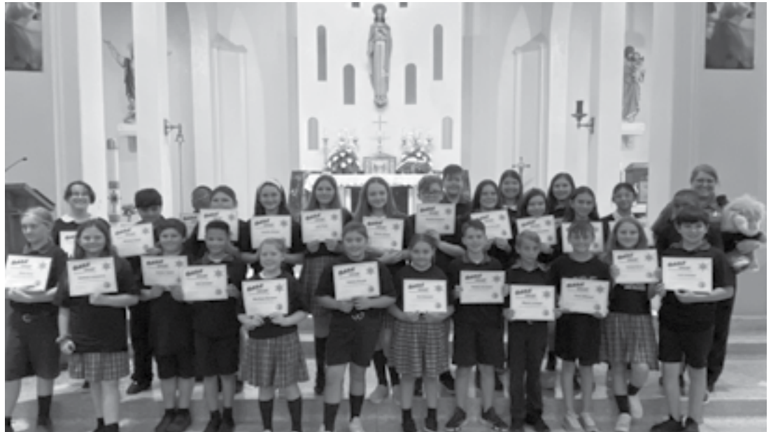
SACRED HEART SCHOOL D.A.R.E. GRADUATION. Sacred Heart School held its annual D.A.R.E. graduation on May 12. The year-long program is for fifth graders. The D.A.R.E. Program works to promote safe and healthy living for students, and gives students skills and information needed to avoid drugs, gangs, and violence. It is sponsored by the Avoyelles Parish Sheriff's Department.

(right) OUR LADY OF PROMPT SUCCOR SCHOOL 6TH GRADE FAREWELL. (RIGHT) On Wednesday, May 18, we celebrated our 6th graders for the final time. We celebrated a final Mass together with families and friends, and had an awards ceremony after. There was a reception provided by the 5th grade parents in the Divine Providence Center following Mass and awards.