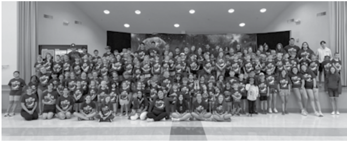
VACATION BIBLE SCHOOL. St. Rita Church, Alexandria hosted their Vacation Bible School June 19 - 23. Over 140 kids and over 40 teen and adult volunteers attended. It was a STELLAR week!