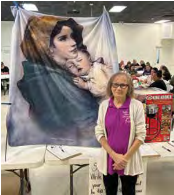
(PICTURED BELOW) ST. ALPHONSUS CHURCH IN HESSMER hosted a Super Bingo the weekend of July 8 and 9. Pictured below are the members of the Altar Society, the silent auction, and volunteers helping to prepare and serve food for the event.

A big thank you to all who generously donated time, money, and talent to bring the teens and families of our region closer to Christ.