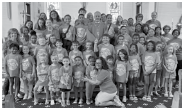
(above) VACATION BIBLE SCHOOL. St. Joseph Church, Marksville held their Vacation Bible School June 12 - 16, 9:00 a.m. - noon. This year's theme was "Shine Jesus' Light."