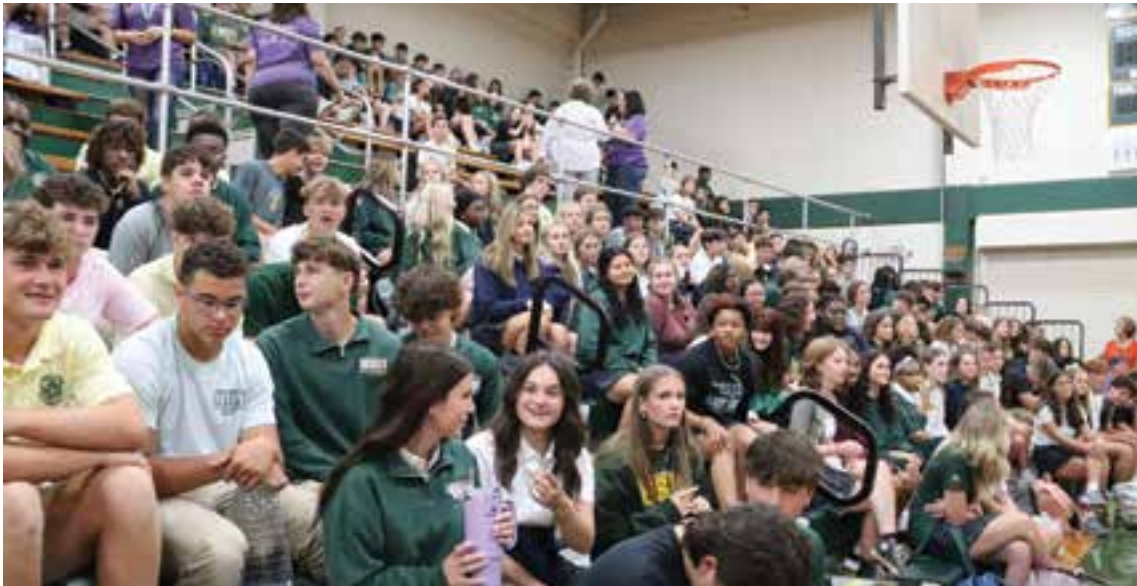
HOLY SAVIOR MENARD CENTRAL HIGH SCHOOL, ALEXANDRIA. First day of classes was Friday, Aug. 11.