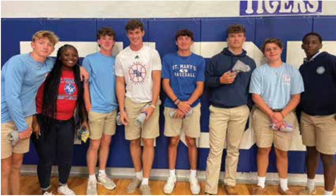
ST. MARY'S CATHOLIC SCHOOL, NATCHITOCHEES. First day of classes was Friday, Aug. 11.