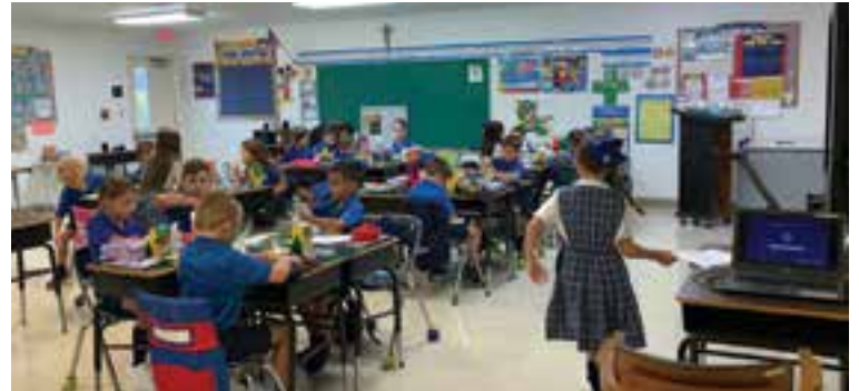
SACRED HEART SCHOOL, MOREAUVILLE. First day of classes was Monday, Aug. 14