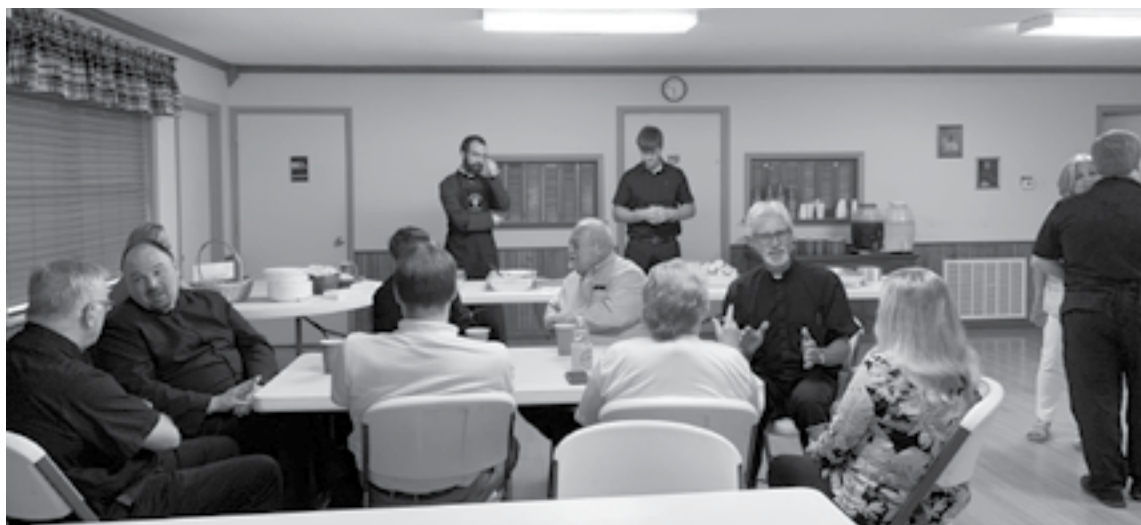
(above) EASTERN DEANERY EVENT AT ST. MARY CHURCH, WINNSBORO HELD ON JUNE 27.