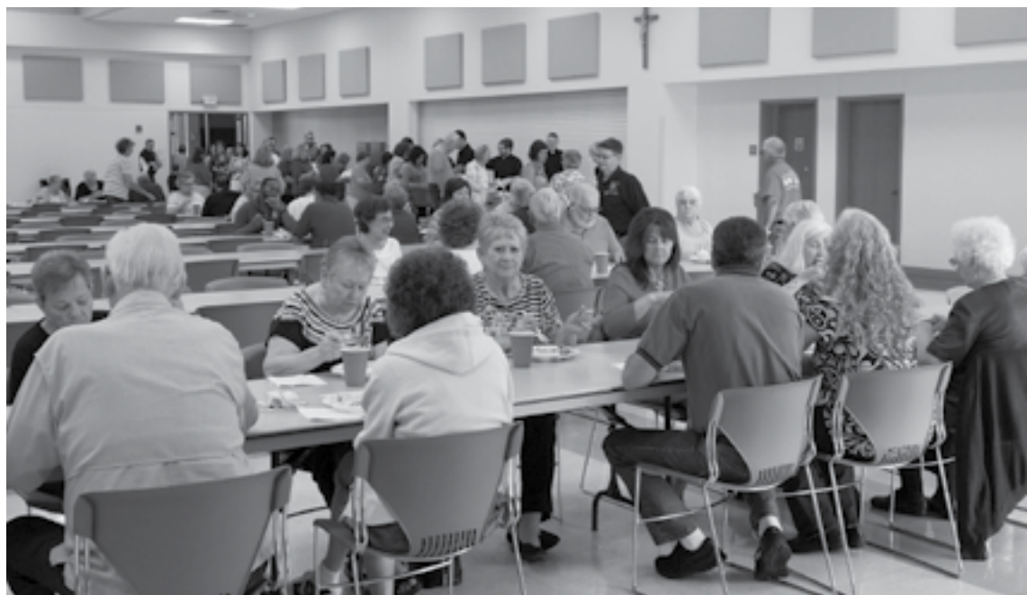
CENTRAL DEANERY EVENT AT ST. RITA CHURCH'S HOLY FAMILY CENTER IN ALEXANDRIA, HELD ON JULY 27.