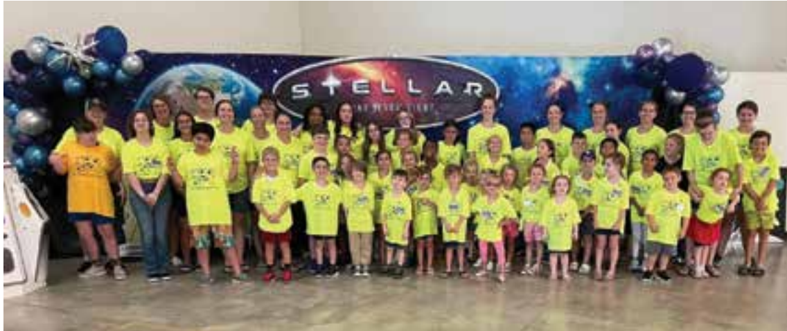
(above) STS. FRANCIS AND ANNE CHURCH IN KOLIN held their Vacation Bible School the week of July 17-21. The kids as well as the teen and adult workers had a Stellar week learning how to Shine Jesus' Light through all of life's circumstances.