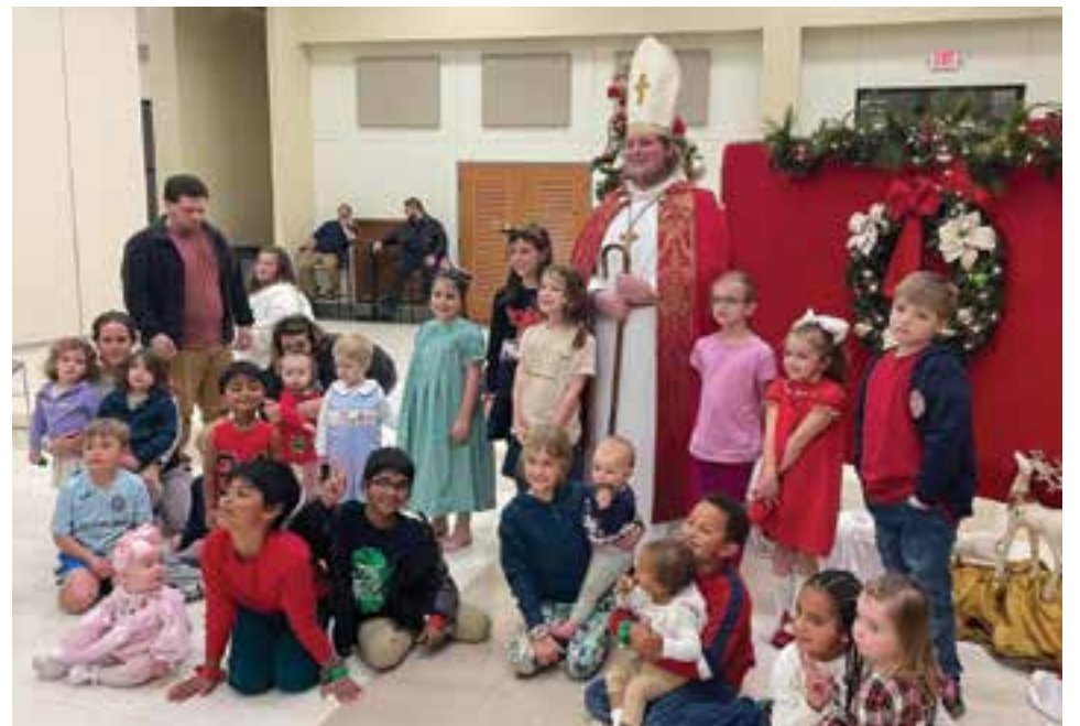
ST. RITA CHURCH, ALEXANDRIA. On Monday, Dec. 4, St. Rita held its annual Saint Nicholas Day Children's Party. Kids were able to visit with St. Nick and take pictures as well as participate in special St. Nicholas activities.