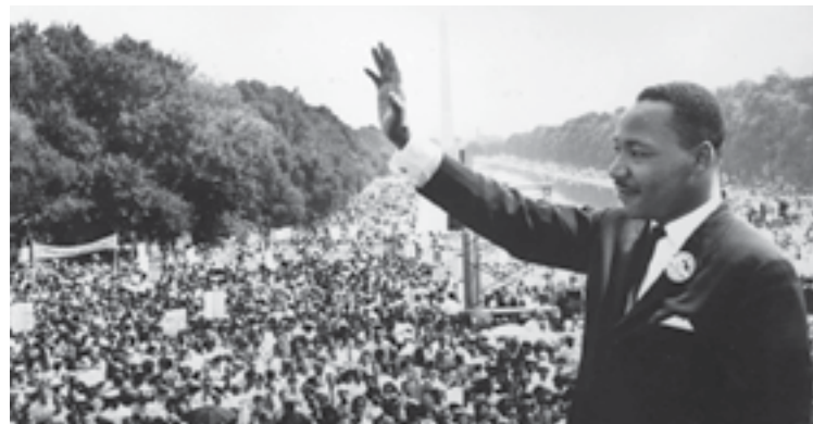
MARTIN LUTHER KING DAY - JAN. 15, 2024. King's birthday is on January 15. The holiday serves as a time for reflection, community service, and the celebration of Dr. King's contributions to the civil rights movement.

More information, dates and sign up are available at www.diocesealex.org .