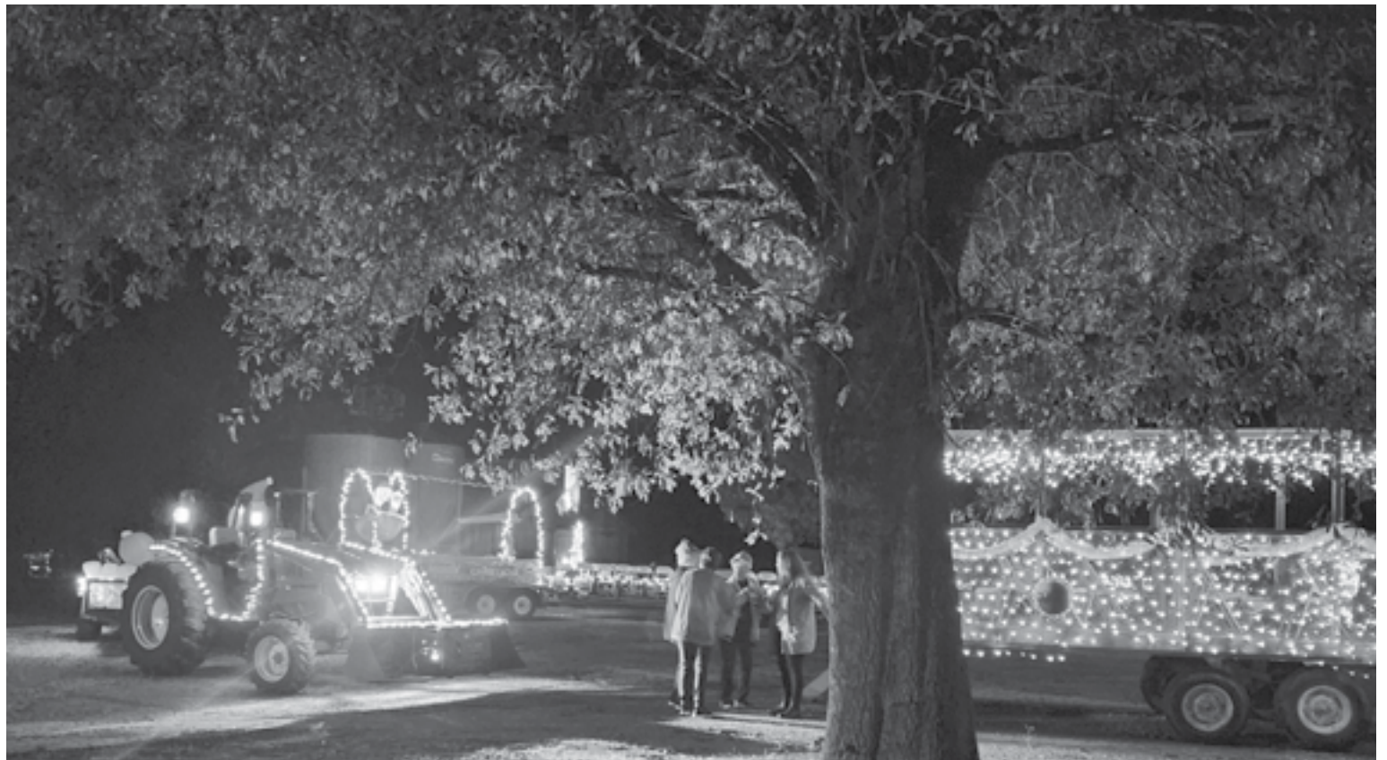
ST. GENEVIEVE CHURCH, BROUILLETTE. Two of the many tractor-pulled trailers on St. Genevieve's annual Christmas Hayride that winds its way along the Red River down Hwy. 452 in the community of Brouillette, LA, Residents open their homes at one of three stops on the route.

On Saturday, Dec. 2, the parish and community came together and held a Christmas hayride. After assisting with the 4:00 p.m. Vigil Mass and dressed for the crisp night air, my wife and I were honored to participate in the evening's events. Tractors pulling trailers adorned with Christmas themed decorations