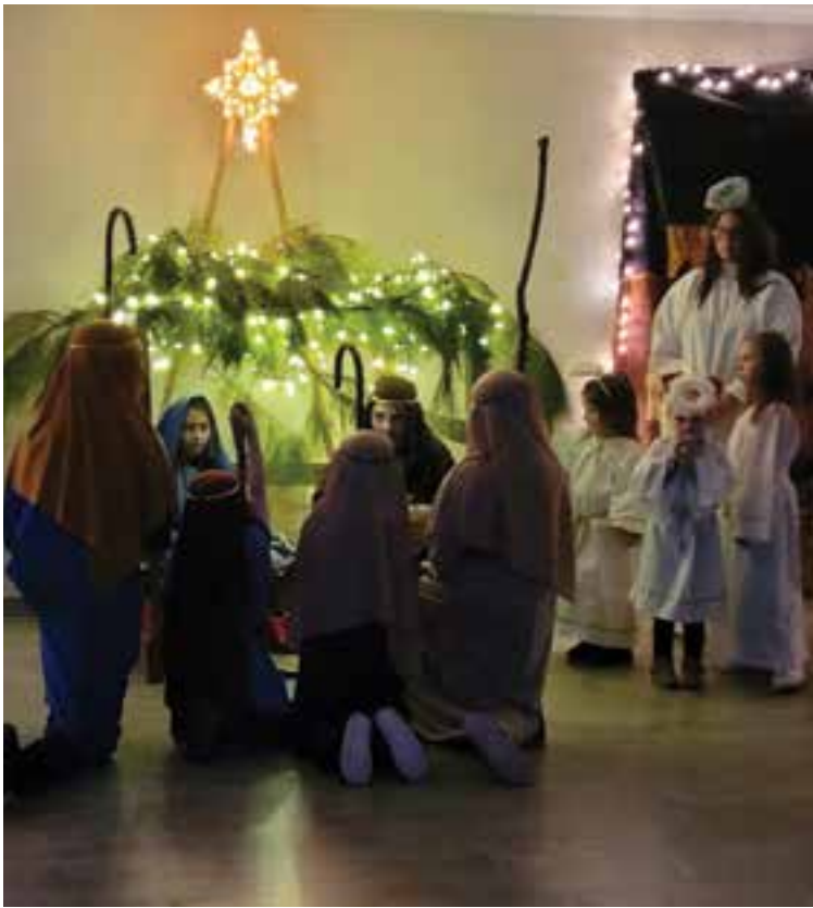
NATIVITY OF THE BLESSED VIRGIN MARY CHURCH, CAMPTI. Nativity BVM's Annual CCD Youth Christmas Program.