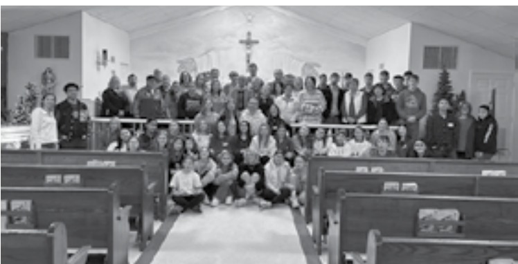
ST. GENEVIEVE CHURCH, BROUILLETTE. Praise Fest was held Sunday, Jan. 14. The day included speakers, scripture breakout sessions, games and fitness, live music, adoration and Holy Mass.