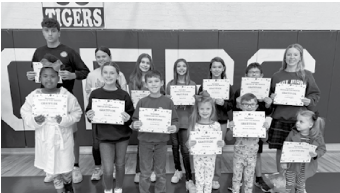
ST. MARY'S CATHOLIC SCHOOL VIRTUE OF THE MONTH The Virtue of the Month for November was "Gratitude."

Ash Wednesday is February 14 go to www.diocesealex.org for Ash Wednesday service times across the diocese.