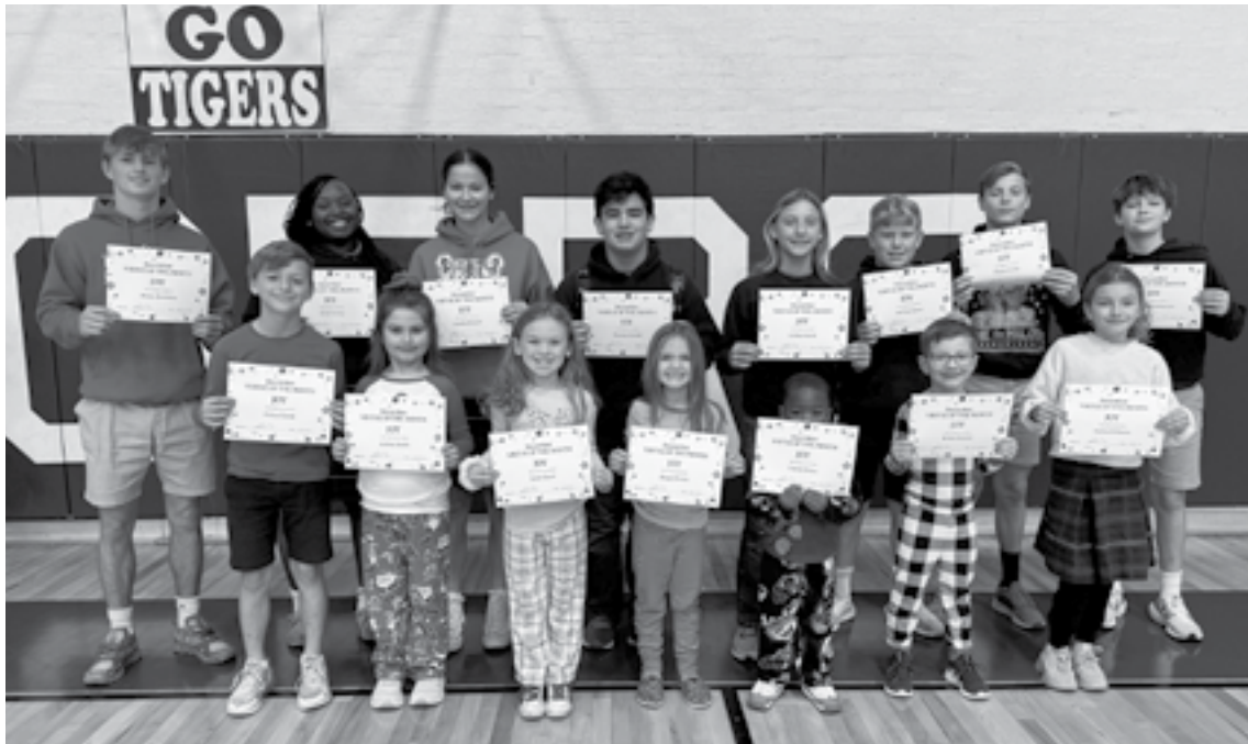
ST. MARY'S CATHOLIC SCHOOL VIRTUE OF THE MONTH. The religion department has a different virtue each month that is discussed and taught. Students that display characteristics of that particular virtue for that month are selected by their teachers. It is announced at Morning Prayer in the gym once a month. The Virtue of the Month for December was "Joy."