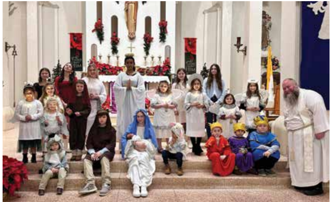
SACRED HEART CHURCH, MOREAUVILLE. 5:00 PM Christmas Eve Vigil Mass and program.

To see more photos from across the diocese, please visit the photo galleries at www.diocesealex.org