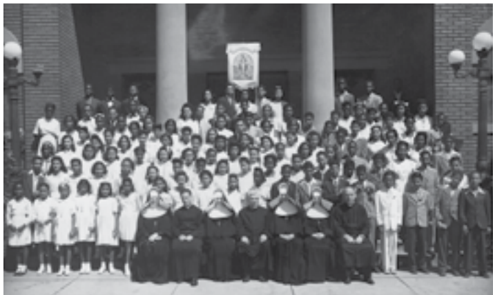
Students pose on the steps of St. James Memorial Church in 1946. First row: the faculty, consisting of the sisters who taught at the school and the pastor of the church. The students are lined up by age, youngest on the bottom row to oldest at the top.