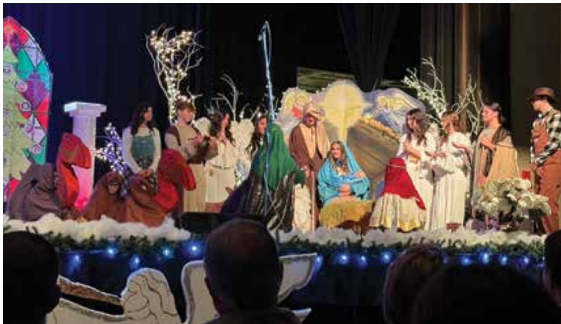
SACRED HEART SCHOOL, MOREAUVILLE. Sacred Heart School held their school Christmas program on Dec. 19, 2023.