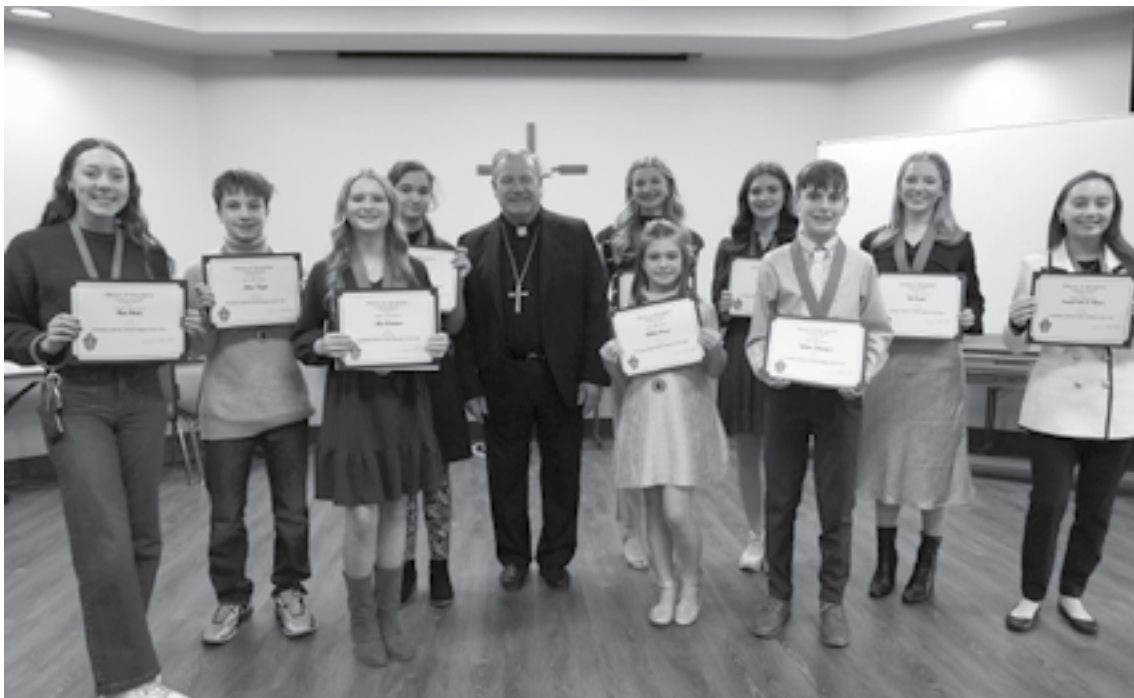
2024 STUDENT OF THE YEAR. The Student of the Year awards were determined on Monday, Jan. 29 at the St. Joseph Catholic Center, Alexandria.