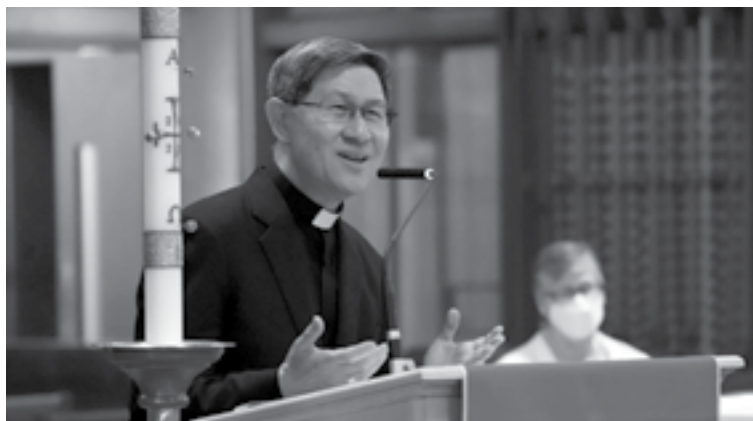
CARDINAL LUIS ANTONIO TAGLE, PREFECT OF THE CONGREGATION FOR THE EVANGELIZATION OF PEOPLES, seen in Maryknoll, N.Y., June 3, 2022, will be Pope Francis' special envoy to the National Eucharistic Congress in Indianapolis July 17-21, it was announced May 18.