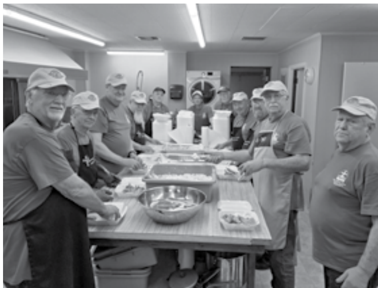
MARY MOTHER OF JESUS. Lenten Fish Fries at Mary Mother of Jesus in connection with the Season of Service Program.