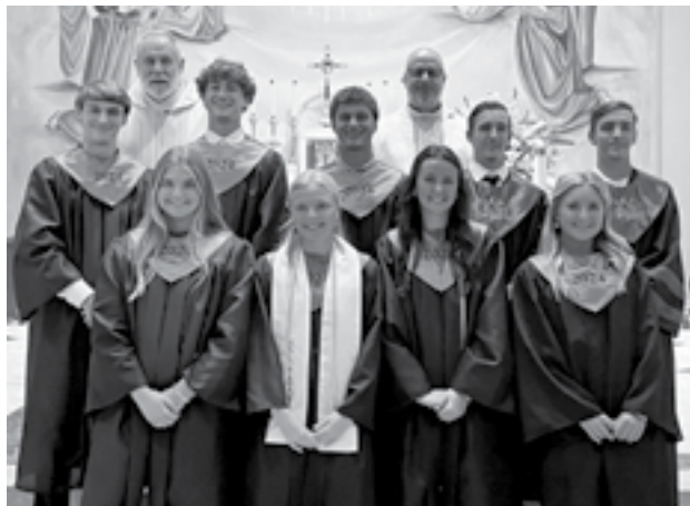
ST JOSEPH CHURCH, MARKSVILLE. On Sunday May 12, a Baccalaureate Mass was held celebrating the class of 2024 high school graduates. Congratulations to all 2024 graduates!