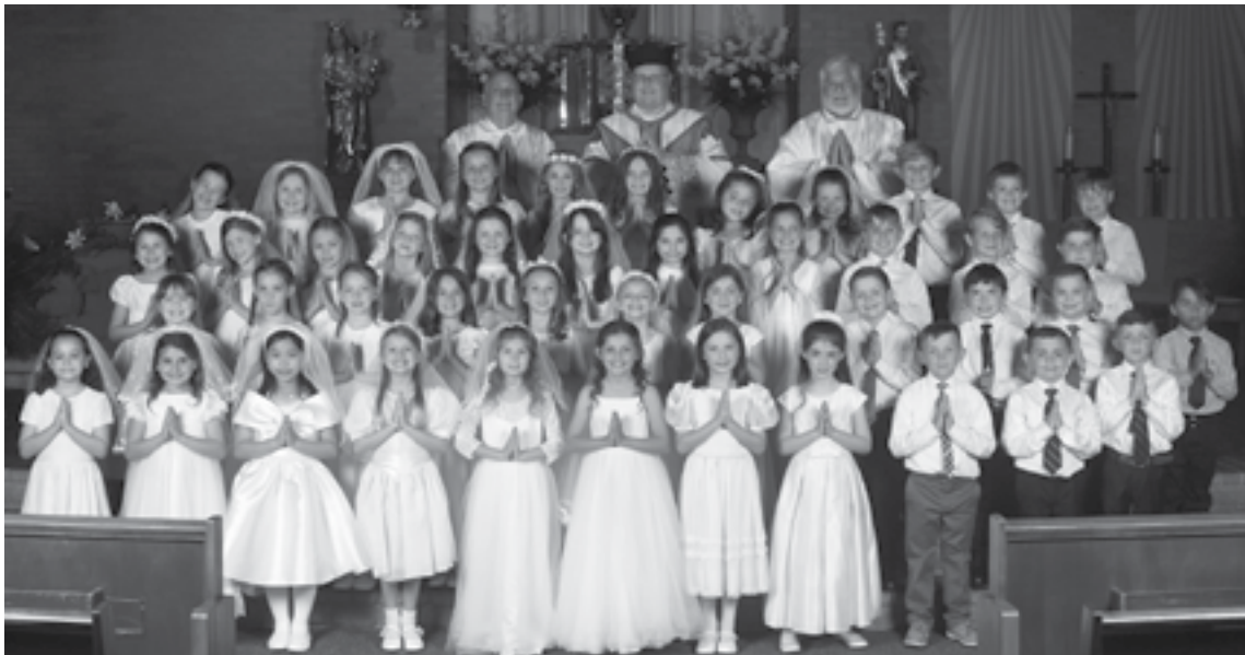
OUR LADY OF PROMPT SUCCOR SCHOOL, ALEXANDRIA , celebrated First Holy Communion on Saturday, May 20 with 47 new communicants. We are so proud of these beautiful souls who now get to encounter Jesus in the blessed sacrament.