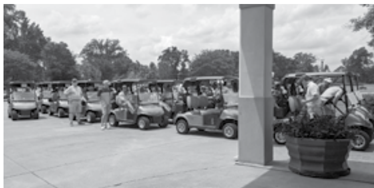
HOLE LOTTA FUN GOLF TOURNAMENT. Golfers get ready to tee-off for the annual Hole Lotta Fun Golf Tournament held at Tamahka Trails golf course in Marksville on April 26. This event benefits Catholic Charities of Central Louisiana and their many ministries. Thank you to all of the sponsors, the volunteers, and the golfers who are supporting CCCenLa!