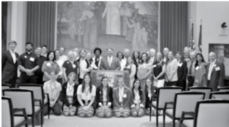
FAITHFUL CITIZENSHIP DAY. Catholic school students join the adult attendees for the session.