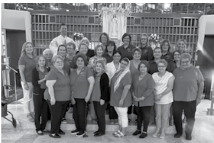
ST. ALPHONSUS CHURCH, HESSMER. The St. Alphonsus Ladies' Altar Society gathered for prayer at a bi-annual event to honor their deceased members on the Sixth Sunday of Easter.

Visit the sign-up form at www.diocesealex.org , or email starver@diocesealex.org with your name and mailing address to receive the Church Today FREE of charge!