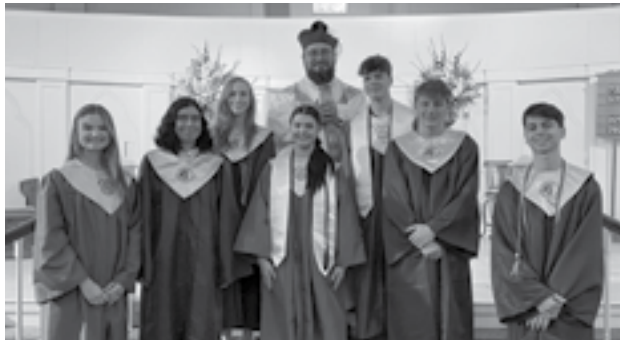
SENIOR MASS, ST. RITA CHURCH, ALEXANDRIA. A Mass was celebrated on Sunday, May 12 for the high school seniors graduating this year from Menard and ASH and who attend St. Rita Church in Alexandria.