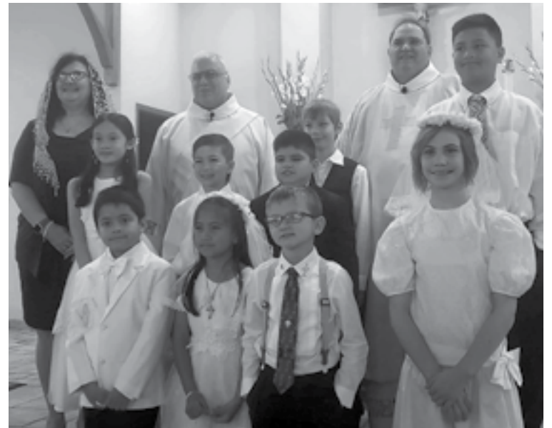
IMMACULATE HEART OF MARY, TIOGA . Sacrament of First Holy Communion was celebrated on Sunday, April 7.