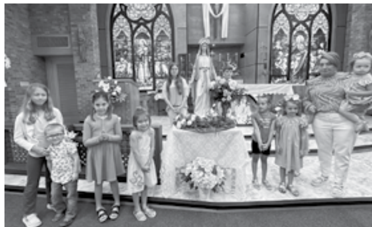
ST. FRANCIS DE SALES CHURCH, ECHO. May Crowning was held May 5.