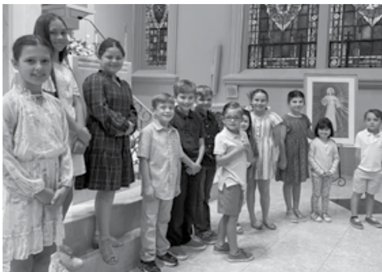
MAY CROWNING, ST JOSEPH CHURCH, MARKSVILLE. Held May Crowning on May 5. The children of St Joseph Church showered Our Loving Mother Mary with Roses.