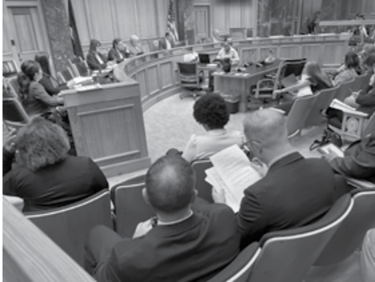
USCCB FAITHFUL CITIZENSHIP DAY. Louisiana legislators convene a session and are joined by members of the LCCB.