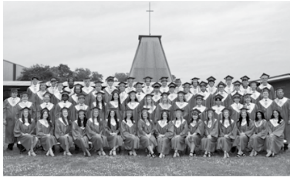
GRADUATING CLASS OF 2024, HOLY SAVIOR MENARD CENTRAL HIGH SCHOOL. Graduation was held Tuesday, May 14.