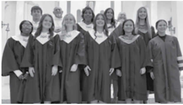
BACCALAUREATE SACRED HEART CHURCH, MOREAUVILLE. 2024 High School graduates are from Avoyelles High School, Avoyelles Public Charter High School, Louisiana School for the Agricultural Sciences, and Bunkie High School.