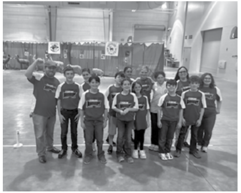
ST. FRANCES CABRINI SCHOOL ARCHERY TEAM. Exciting news! The Cabrini School Archery Team competed in a thrilling 3D shootout sponsored by Louisiana Department of Wildlife and Fisheries! It was an incredible experience for the students filled with skill and teamwork.