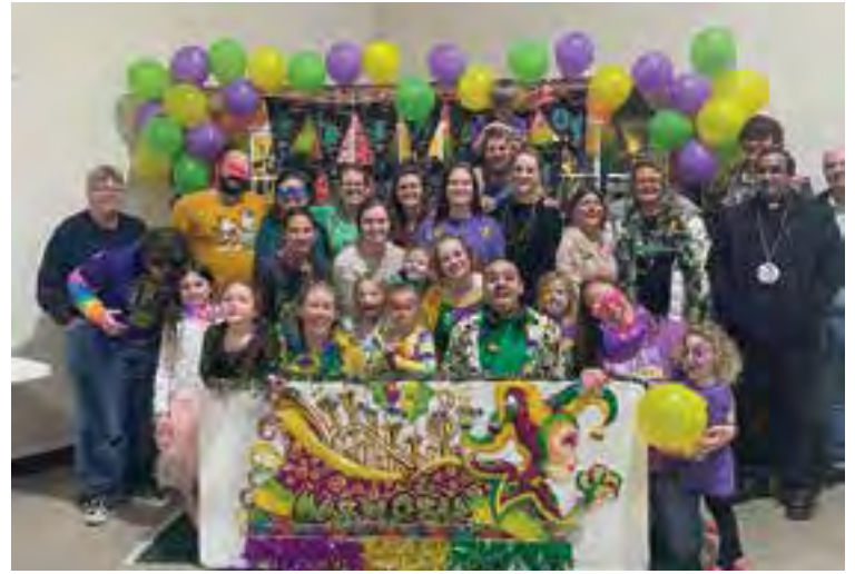
KOLIN MARDI GRAS. Sts. Francis and Anne's Krewe of Christ Youth Mardi Gras Ball.