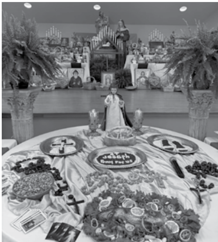
ST. RITA CHURCH, ALEXANDRIA. St. Joseph's Altar on Sunday, March 16. Monetary donations and all food from the altar was donated to the Manna House.