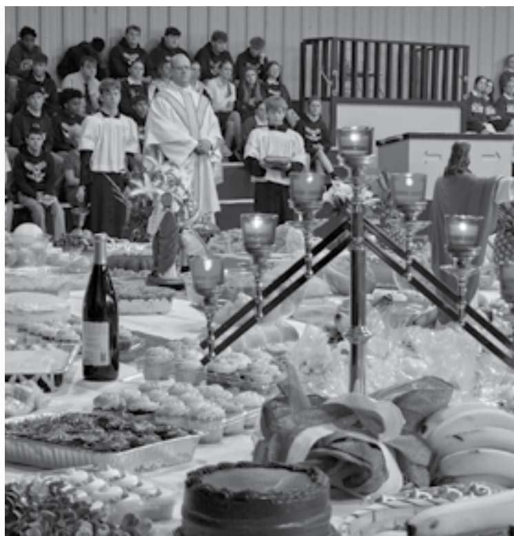
ST. JOSEPH SCHOOL. On Wednesday, Mar. 19, St. Joseph School, Plaquemine celebrated the Feast of their patron saint. The day was marked with a reconsecration of the school to the TWO Hearts and a blessing of the St. Joseph Altar.