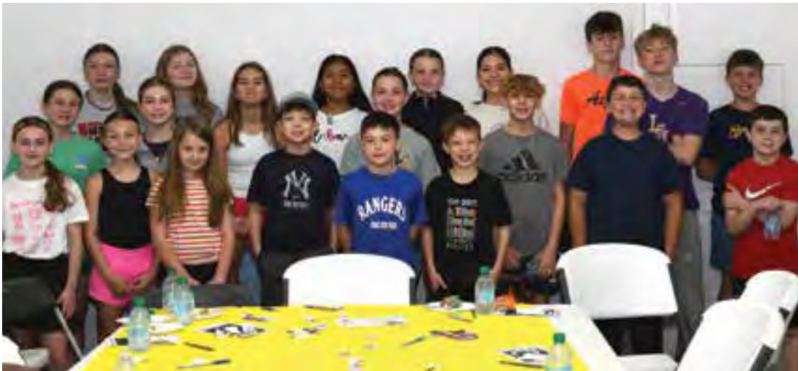
ST. ANTHONY OF PADUA, BUNKIE. On Saturday, Feb. 15, the Children of Mary Congregation of St. Anthony of Padua, Bunkie, celebrated their Mardi Gras and Lent preparation meeting.