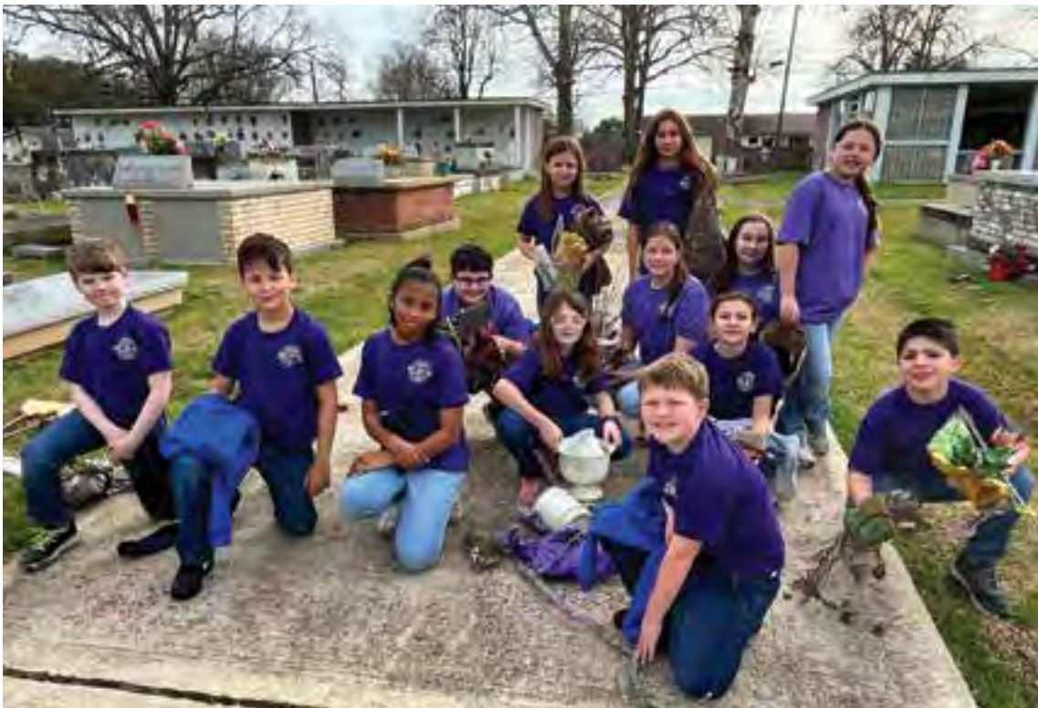
SEASON OF SERVICE, SACRED HEART SCHOOL. One of our Sacred Heart School 4th grade classes spent time one morning recently cleaning the church cemetery as an SOS project.