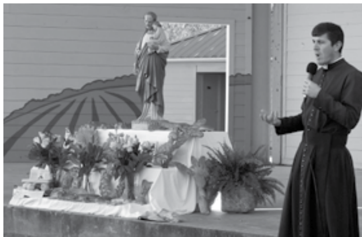
ECUMENICAL ST. JOSEPH'S ALTAR COMMUNITY POTLUCK. On Sunday, Mar. 16, a St. Joseph altar for the entire community of St. Joseph, LA was hosted by St. Joseph Catholic Church. It was an ecumenical potluck and pastors and churches from all over St. Joseph brought food, sang, spoke and prayed. It was a wonderful event.