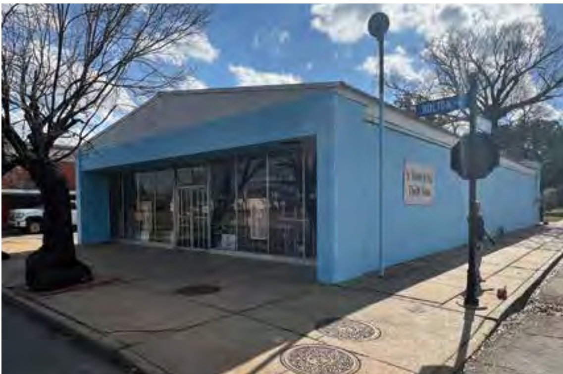
The Knights of Columbus Charles P. Greco Council #1134 (St. Rita Church, Alexandria) freshened up the exterior of the St. Vincent de Paul Thrift Store on Bolton Avenue in Alexandria by giving it a coat of blue paint.