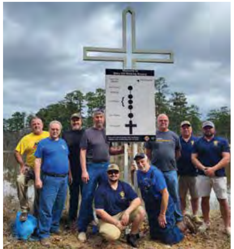
(above and left) SEASON OF SERVICE PROJECTS - KNIGHTS OF COLUMBUS GROUPS. Members of the Knights of Columbus, St. Alphonsus Council #3088 (Hessmer) volunteered their weekend and installed the signs for the new rosary walk at Maryhill Renewal Center. It is an extensive path through the wooded acreage.