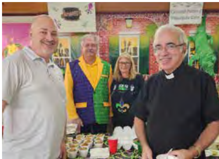
(right) ST. GENEVIEVE CHURCH "TASTE FROM THE COUNTRY." A sold-out crowd attended Taste From the Country on Saturday Feb 15th at St. Genevieve Catholic Church in Brouillette. Following the 4pm vigil mass, those in attendance were treated to almost 30 different sampling of dishes. This annual fundraiser for the church has been a success for many years. And ho could it not be with dishes such as fired catfish, hot cracklins, chicken stew and I think my favorite smoked pork loin. And I do not want to leave out the homemade blackberry cobbler and the pineapple/caramel pecan cake along with other deserts.