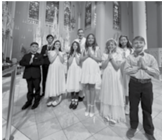
FIRST COMMUNION, ST. FRANCIS XAVIER CATHEDRAL. Eight children from St Francis Xavier Cathedral CCD and OCIA made their First Communion this year.