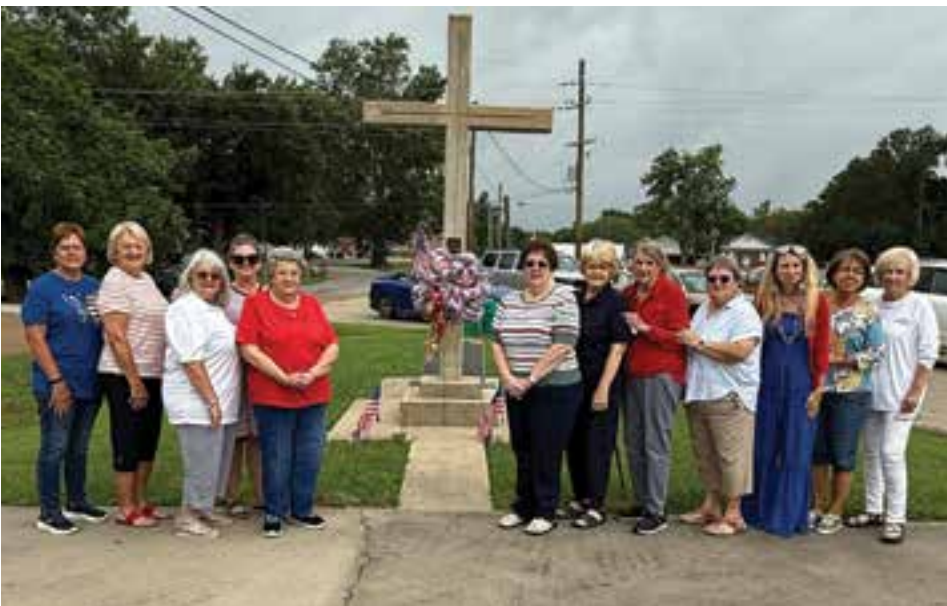
CATHOLIC DAUGHTERS ST. JOSEPH CHURCH, MARKSVILLE. May was a busy month for the Catholic Daughters as they participated in May crowning on Mother's Day and a prayer service at Mausoleum #1 on Memorial Day. Several veterans were there to participate as well.