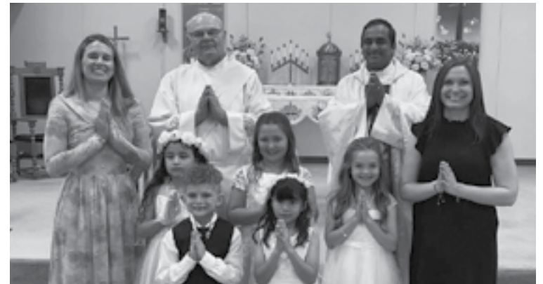
FIRST COMMUNION CLASS OF 2025 FROM STS. FRANCIS & ANNE CHURCH IN KOLIN.