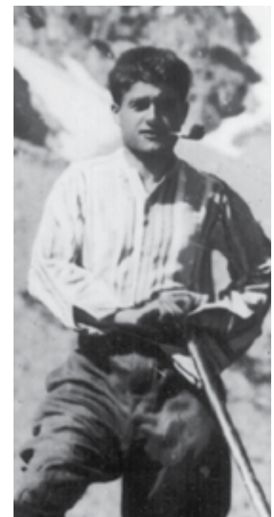
BLESSED PIER GIORGIO FRASSATI OF TURIN, ITALY set to be canonized Sept. 7, 2025.

As we prepare for the canonizations of Blessed Carlo Acutis and Blessed Pier Giorgio Frassati, the Church is not just honoring the past—it’s declaring boldly that sainthood is for