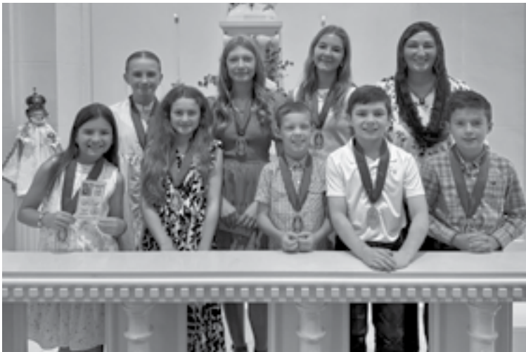
CHILDREN OF MARY CONGREGATION AT ST. ANTHONY OF PADUA, BUNKIE. On Sunday, May 18, eight children were received into the Children of Mary Congregation at St. Anthony of Padua Church in Bunkie. Thank you to all the parents who are instilling beautiful values and faith roots into their children. Love begins at home and then we go and spread the love of Christ to all!