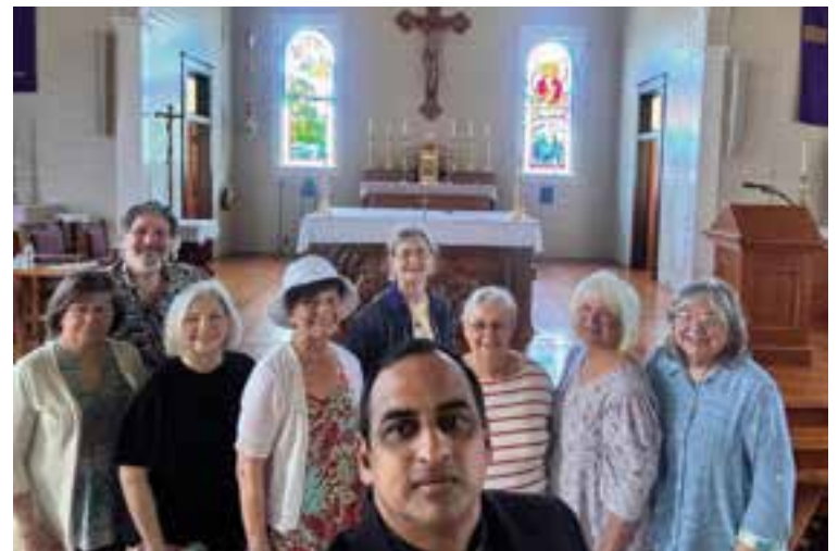
STS. FRANCIS & ANNE CHURCH JUBILEE PILGRIMAGE. During their Diocesan Jubilee Year pilgrimage, members of Sts. Francis & Anne Church in Kolin enjoyed the beauty of St. Augustine Church in Isle Brevelle.