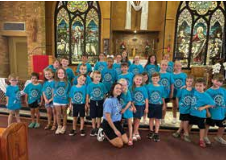
VACATION BIBLE SCHOOL, ST. FRANCIS DE SALES CHURCH, ECHO. "Trusting Jesus In A Wild World" was the theme for Vacation Bible School at Saint Francis DeSales Catholic Church in Echo.