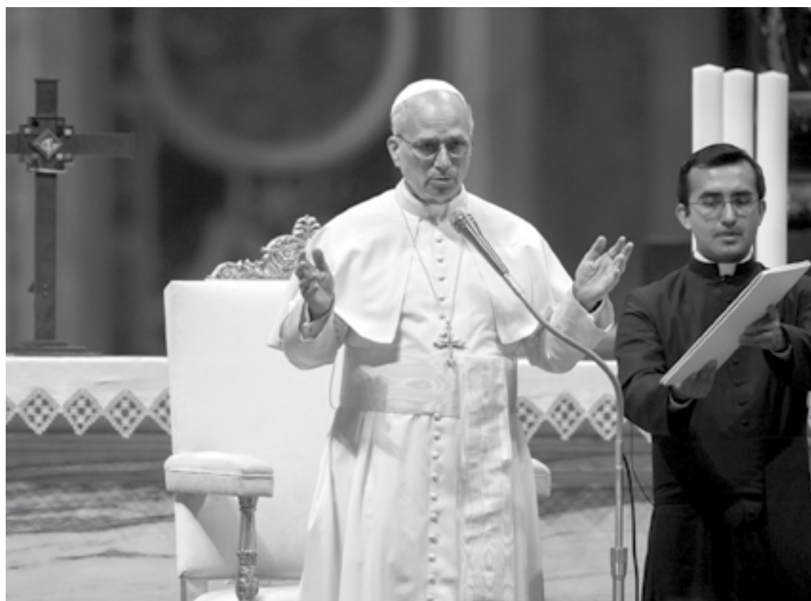
POPE LEO XIV ADDRESSES JUBILEE PILGRIMS IN ROME. Pope Leo XIV prays at the conclusion of an audience with pilgrims in Rome for the Holy Year 2025 in St. Peter’s Basilica at the Vatican June 14, 2025.

Born in 130 in Asia Minor and later serving as bishop in present-day France, St. Irenaeus “carried with him the witness of those who had directly known the Apostles,” the pope said. His life and ministry reflected the way in which cultures, peoples and churches can mutually enrich one another — a dynamic the