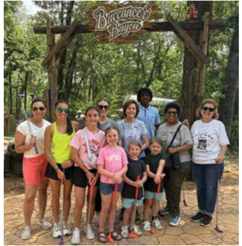
NATIVITY OF THE BLESSED VIRGIN MARY CHURCH, CAMPTI. The Annual Youth Family Fun outing was held at Dark Woods Buccaneers Bayou Mini Golf.