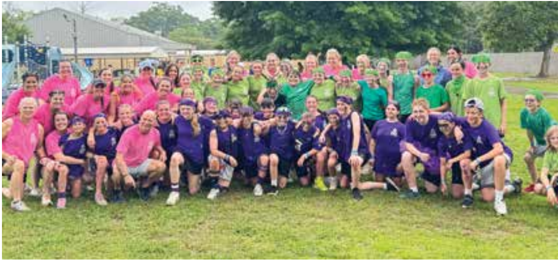
OUR LADY OF PROMPT SUCCOR SCHOOL FIELD DAY. Field Day - On a rainy Friday, OLPS held it's annual Field Day! We held our games inside, but we were able to have our 6th grade vs. staff kick-ball game! Congratulations to our 6th graders for breaking a 20 year winning streak for the teachers!