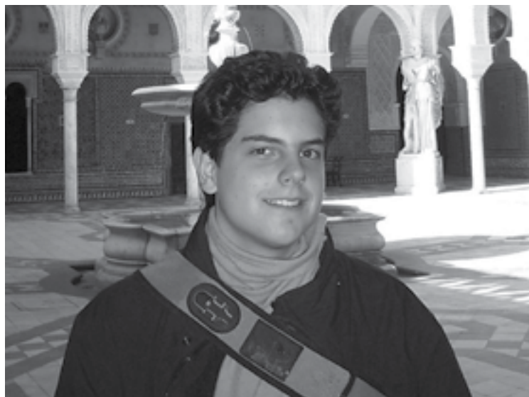
CANONIZATION SET FOR SEPT. 7, 2025. Blessed Carlo Acutis, patron of teenagers and computer programmers, pray for us!

Blessed Pier Giorgio Frassati, born in 1901 in Turin, Italy, is beloved for his active faith, devotion to the poor, and passion for mountain climbing. Known for his motto, “Verso l’alto” (“to the heights”), Frassati lived a vibrant life of service, prayer, and political activism rooted in Catholic social teaching. He died of polio at just