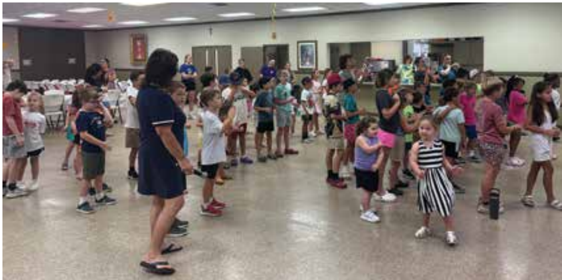
VACATION BIBLE SCHOOL ST. JOPSEH CHURCH, MARKSVILLE. VBS was held June 23-27.