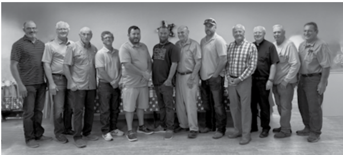
NATIVITY OF THE BLESSED VIRGIN MARY CHURCH, CAMPTI, honored all fathers on Father’s Day with a breakfast brunch.