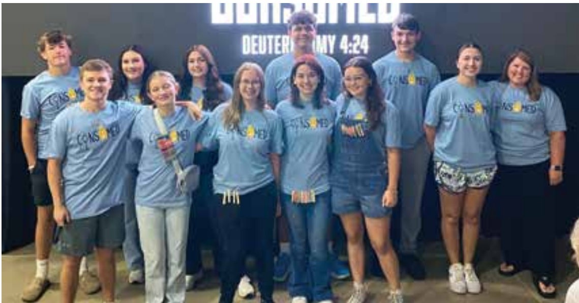
ST. RITA YOUTH GROUP ATTENDS STEUBENVILLE SOUTH YOUTH CONFERENCE. St. Rita Church, Alexandria Youth leaders and Chaparones led a group of 16 to the Steubenville South Conference.