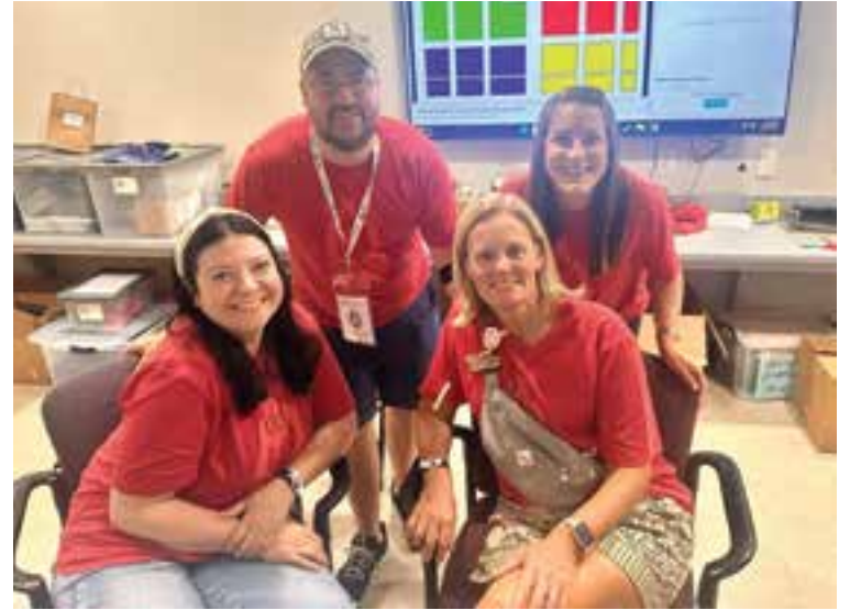
STEUBENVILLE SOUTH 2025. A special thanks to our staff and volunteers for working so tirelessly behind the scenes to bring so many teens and their families closer to Christ.