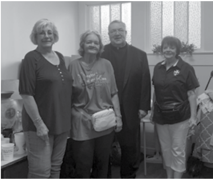
MOTHER BETTINI THRIFT CENTER RE-OPENS. St. Anthony Church in Bunkie, re-opened the Mother Bettini Thrift Center at 610 Rose Street on Friday, June 6. The newly renovated center features gently used clothing for all ages, small household furnishings, and kitchenware. It also sells occasional holiday items. The center is an outreach ministry of the church parish and is managed by volunteers from the St. Anthony Catholic Daughters, Court #968. Hours of operation for shopping and sales are each Friday from 9:00 a.m. until noon. Donations are best delivered to the carport of the center by Monday of each week when ladies are available for processing.