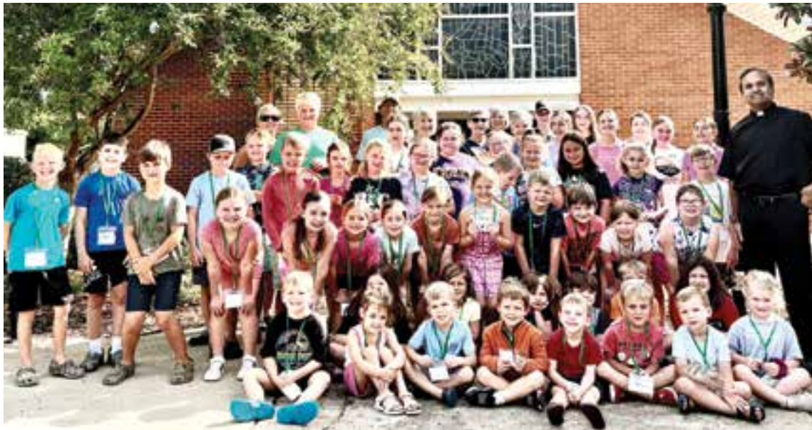
IMMACULATE CONCEPTION CHURCH, DUPONT hosted their VBS from June 18-20. Forty kids attended and many youth and volunteers helped during the two-day event.