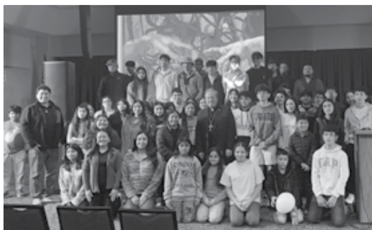
THE 2025 JORNADA JUVENIL , an event for Latino youth of the Diocese of Alexandria held at OLPS in January of this year.