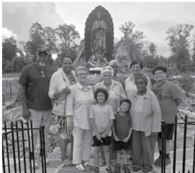
JUBILEE PILGRIMS FROM HOLY GHOST CHURCH, MARKSVILLE. The Holy Ghost pilgrimage group visited Our Lady of Guadalupe Mission Church in Forest Hill, one of the designated pilgrimage sites within the Diocese of Alexandria.

The archbishop added, “There’s no home to go back to, because home is here.”