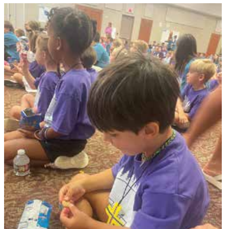
VACATION BIBLE SCHOOL OLPS, ALEXANDRIA was held June 9-13. The theme was "True North, Trusting Jesus in a Wild World".